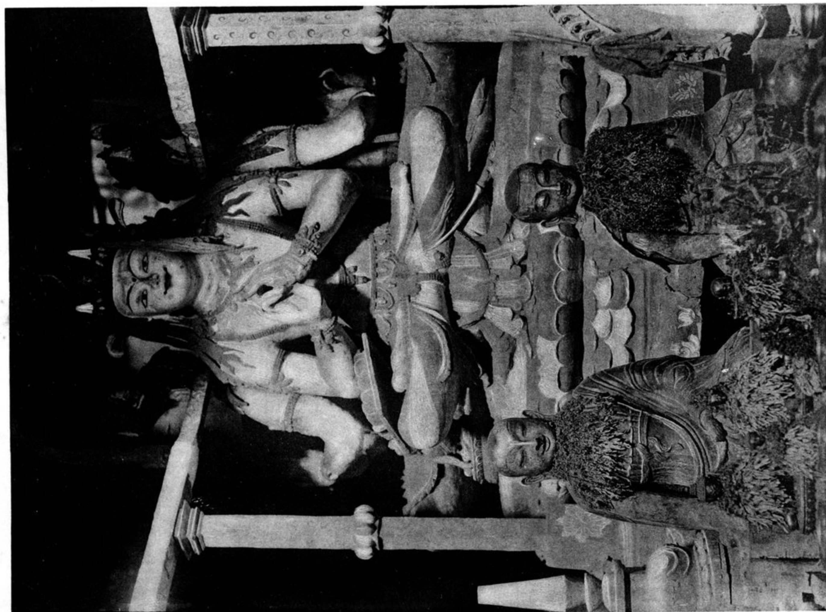
a. Image of rNam-par-snang-mdzad or Vairochana in central hall of Monastery, Tabo.