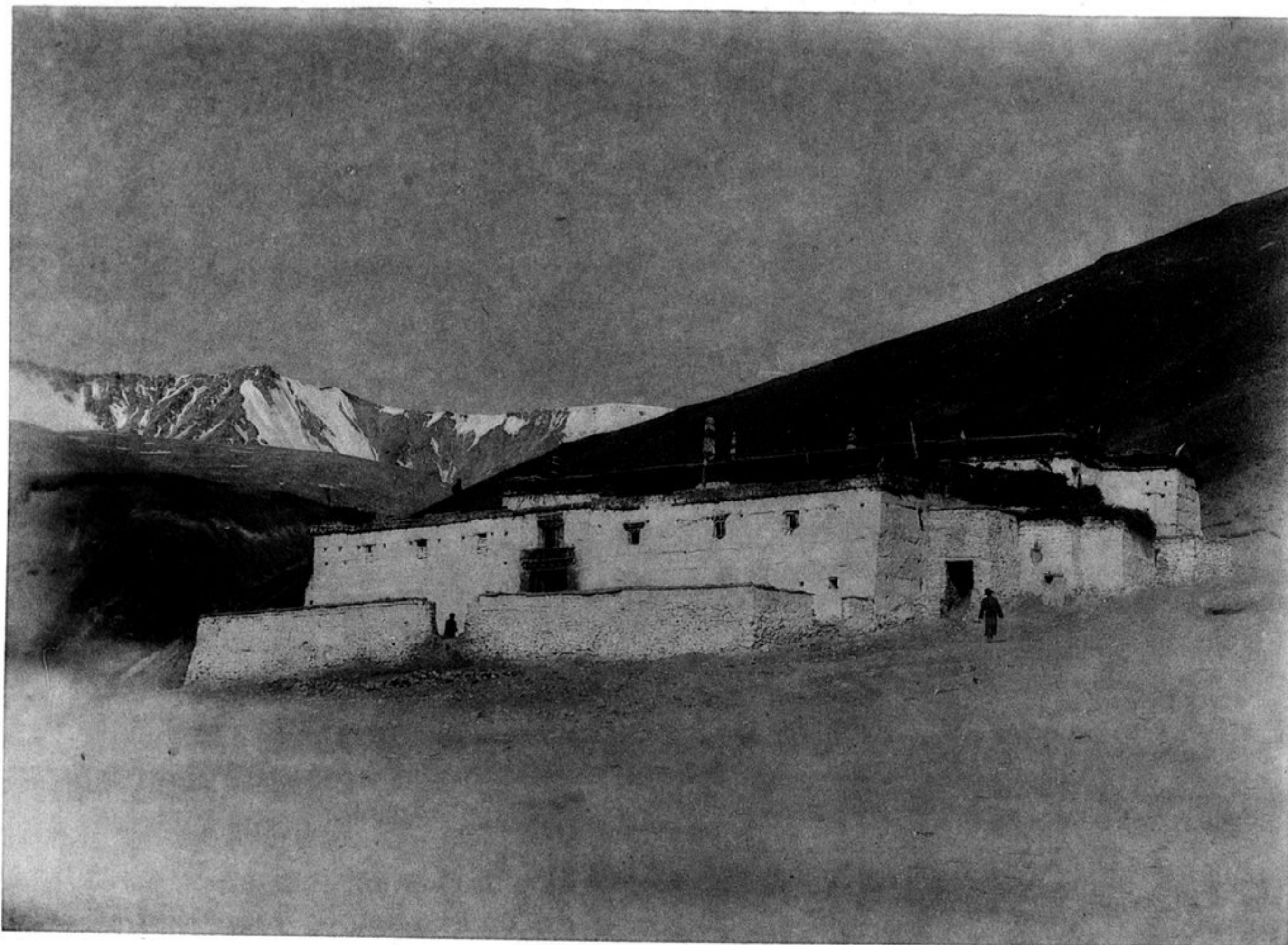
a. dKor-dzod Monastery, Rubshu.