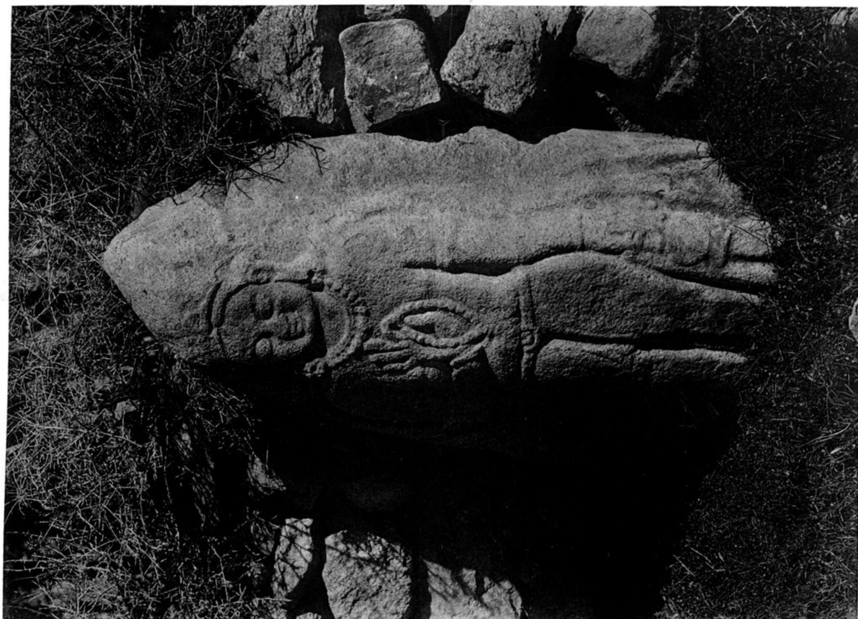
b. Rock-cut image of Maitreya on the Yarkandi road, Leh.