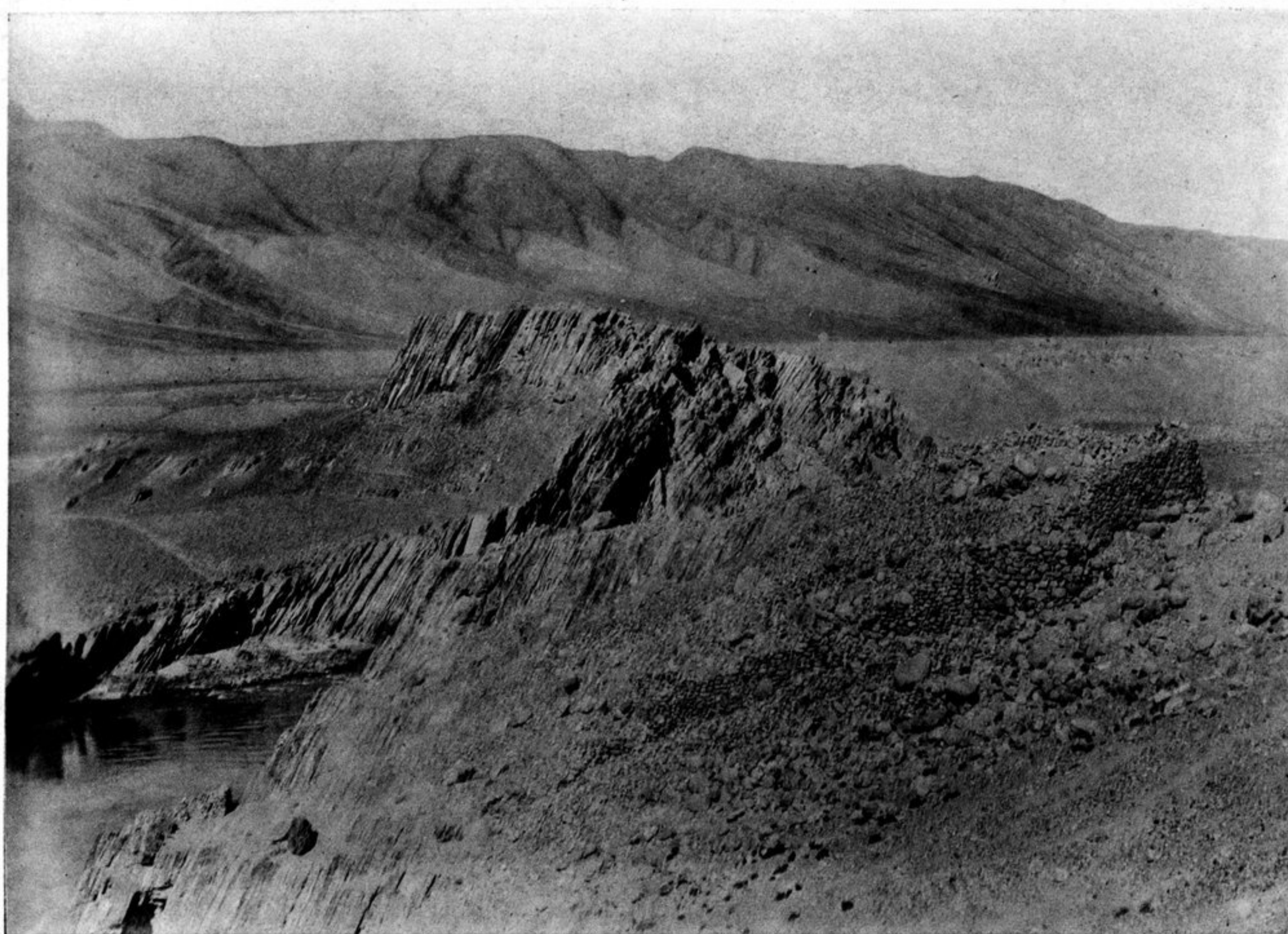
a. Ruined castle Chung-mkhar at sNyemo.