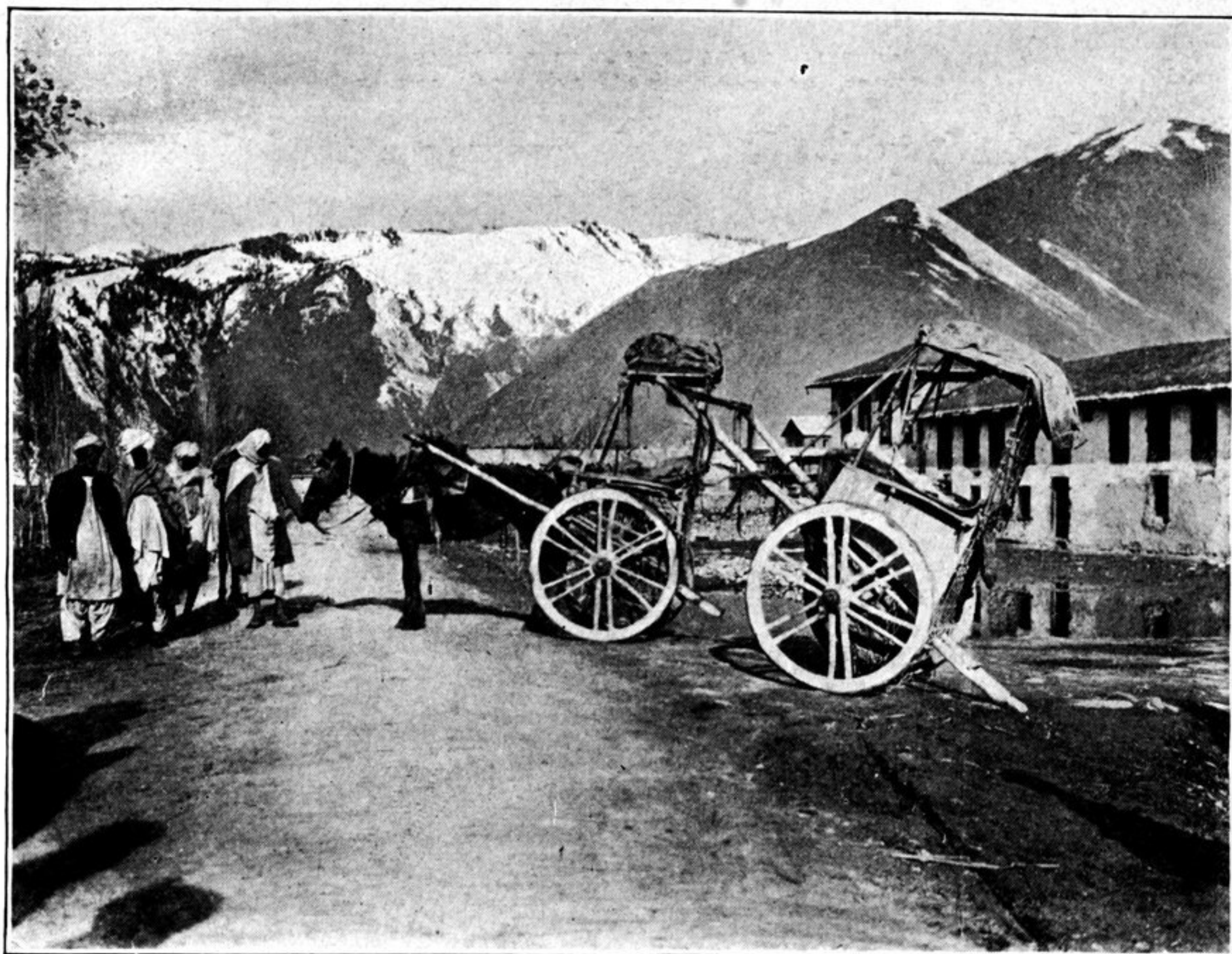
“EKKAS,” OR TWO-STORY CARTS AT BARAMULA ON THE EDGE OF THE KASHMIR PLAIN