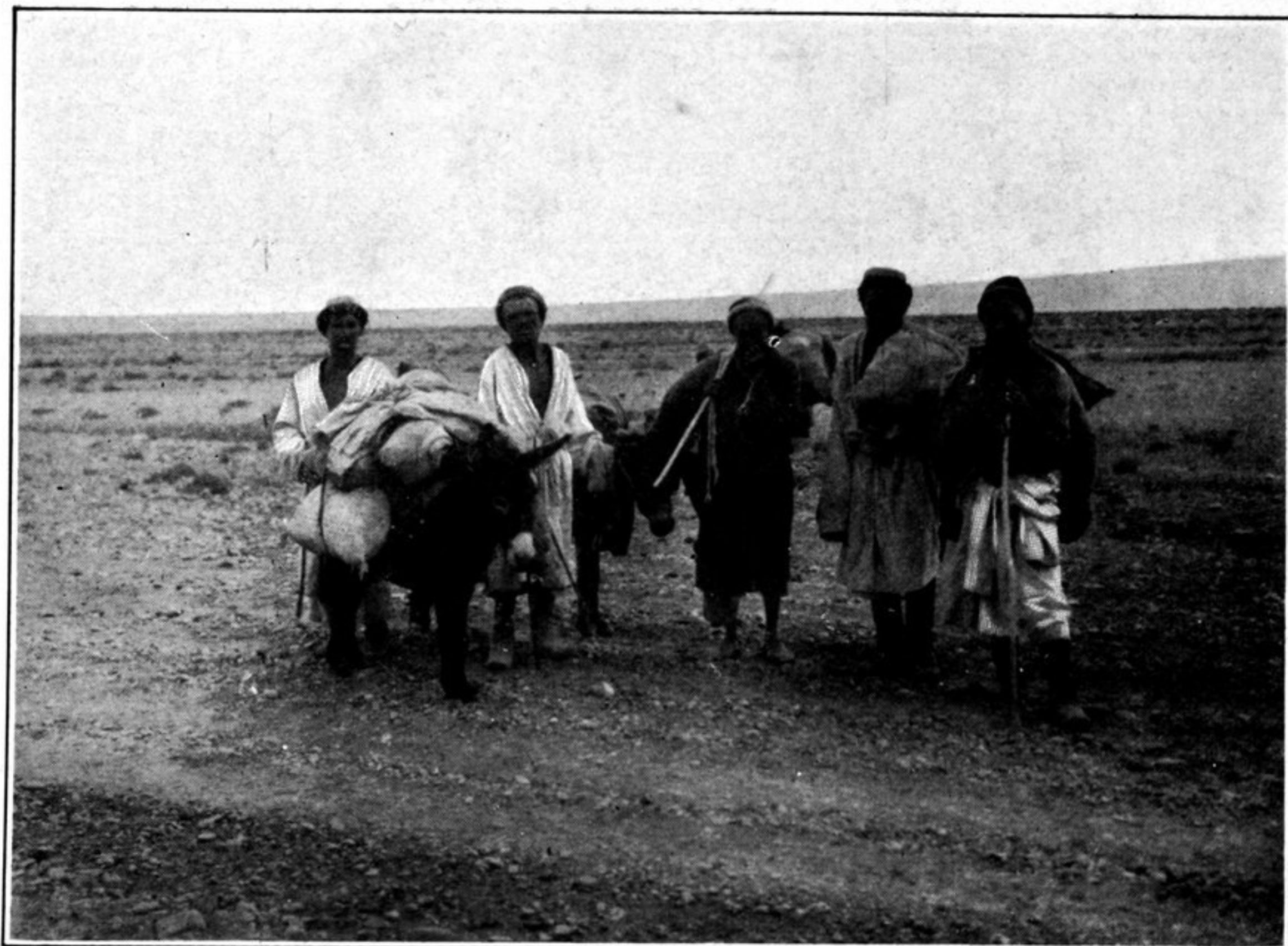
CHANTO LABORERS IN THE ZONE OF PIEDMONT GRAVEL, NEAR KASHGAR

Illustrating the outer zone of the floor of the Lop basin