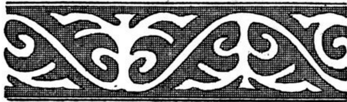
Bands of woolen cloth (used for tying the walls of a khibitka)