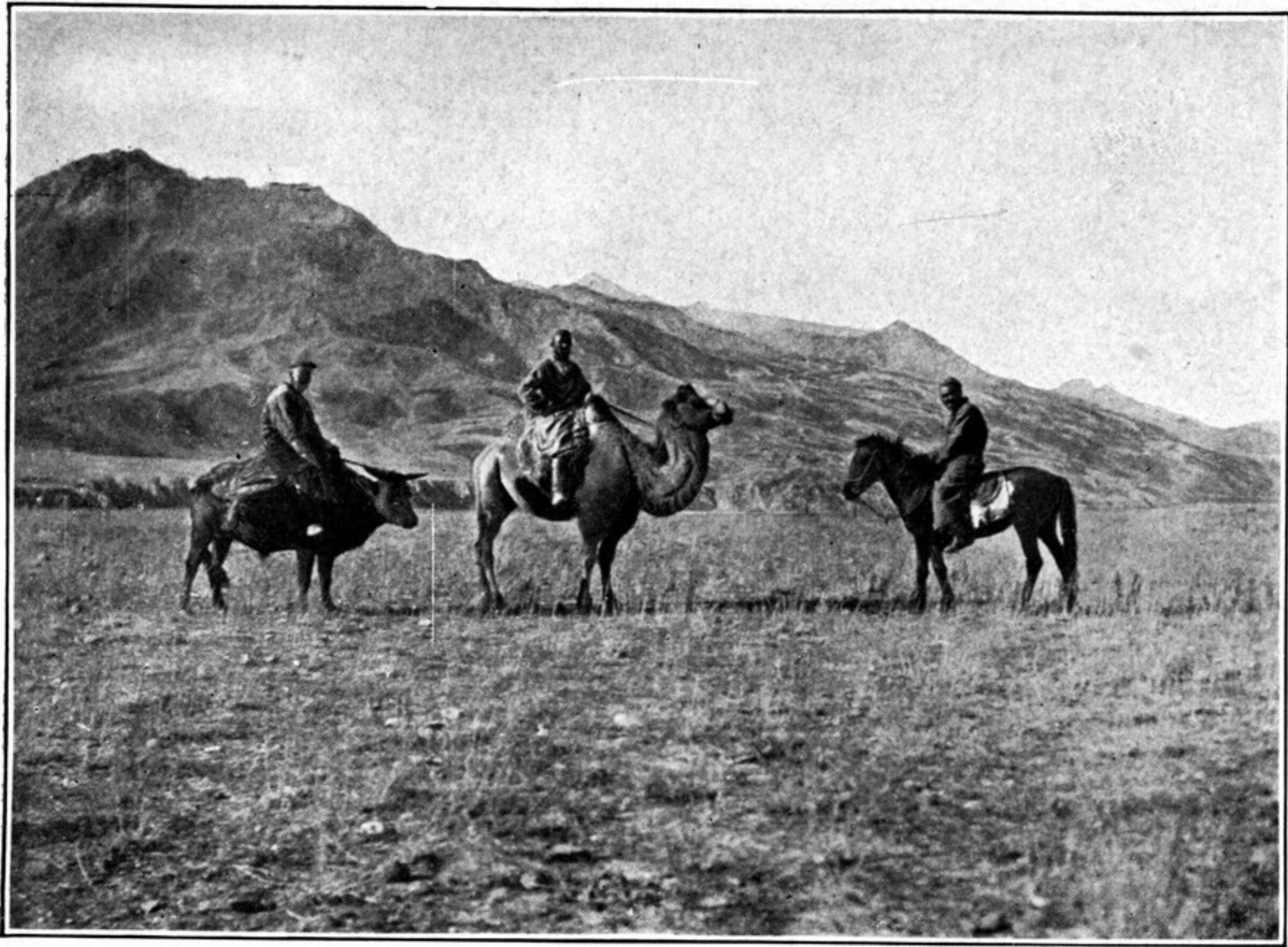
A CHANCE MEETING OF KHIRGHIZ IN TIAN SHAN