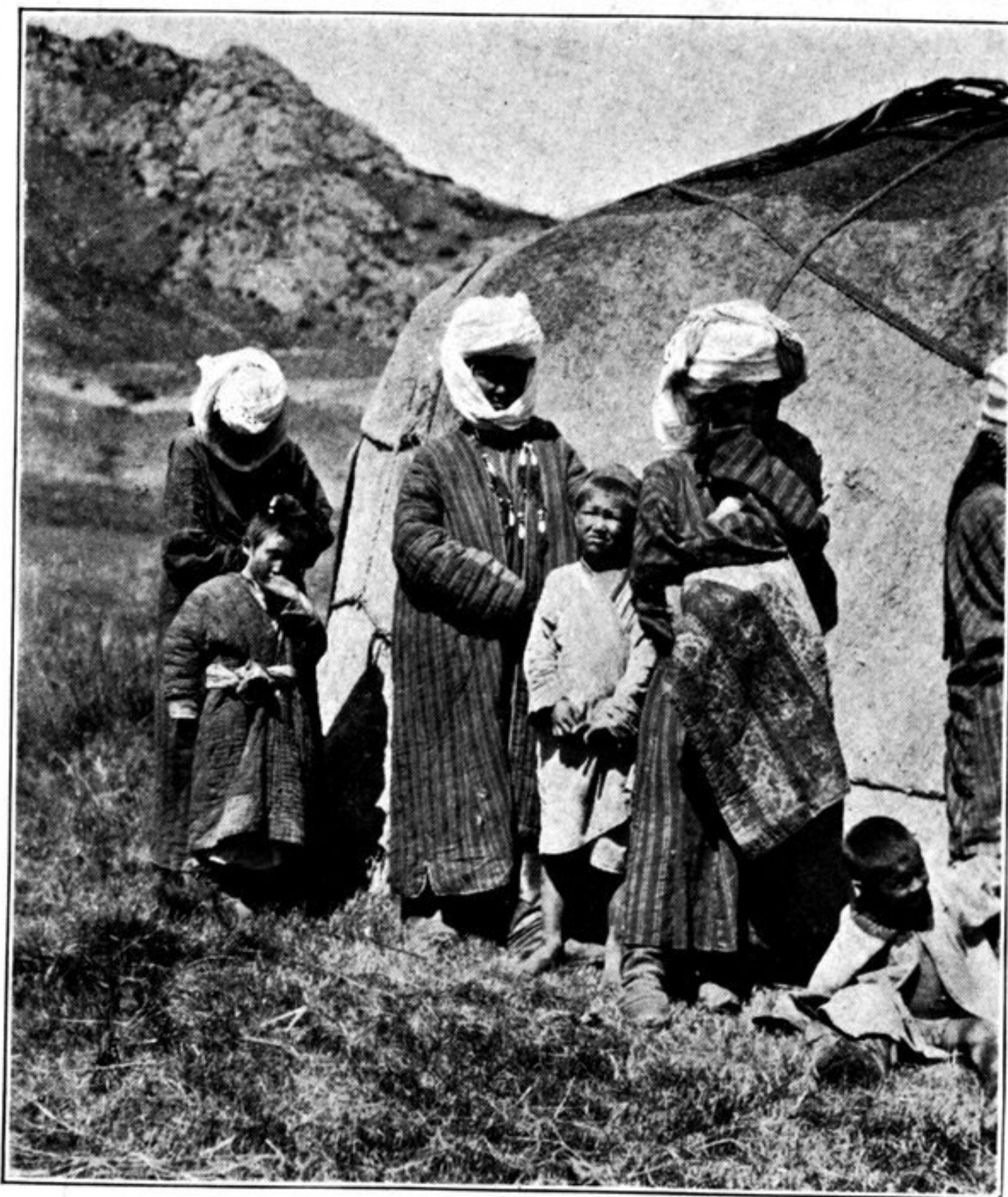
KHIRGHIZ WOMEN IN HOLIDAY DRESS MAKING CALLS