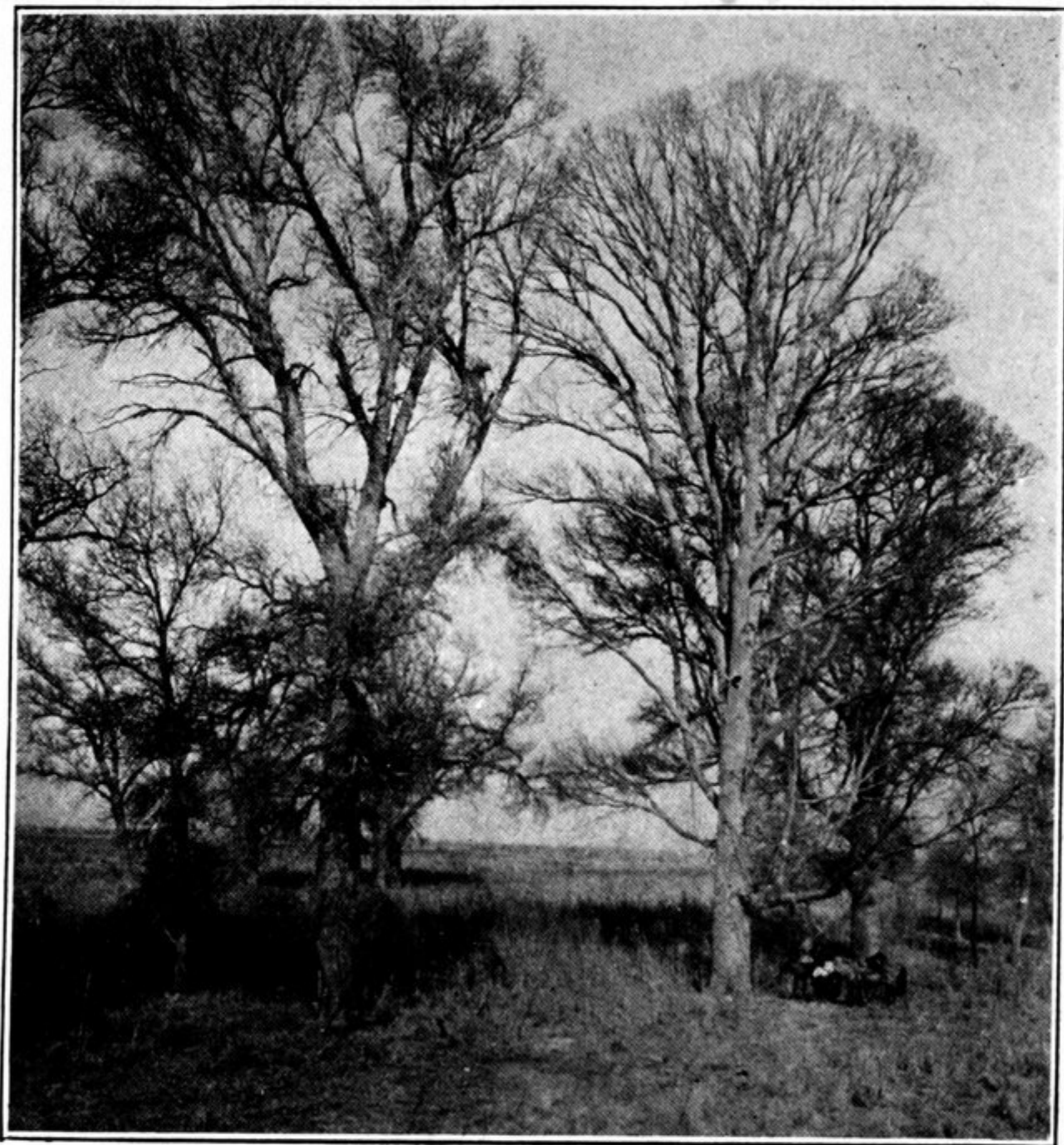
POPLAR TREES UNDER IDEAL CONDITIONS OF WATER SUPPLY NEAR THE CHERCHEN RIVER