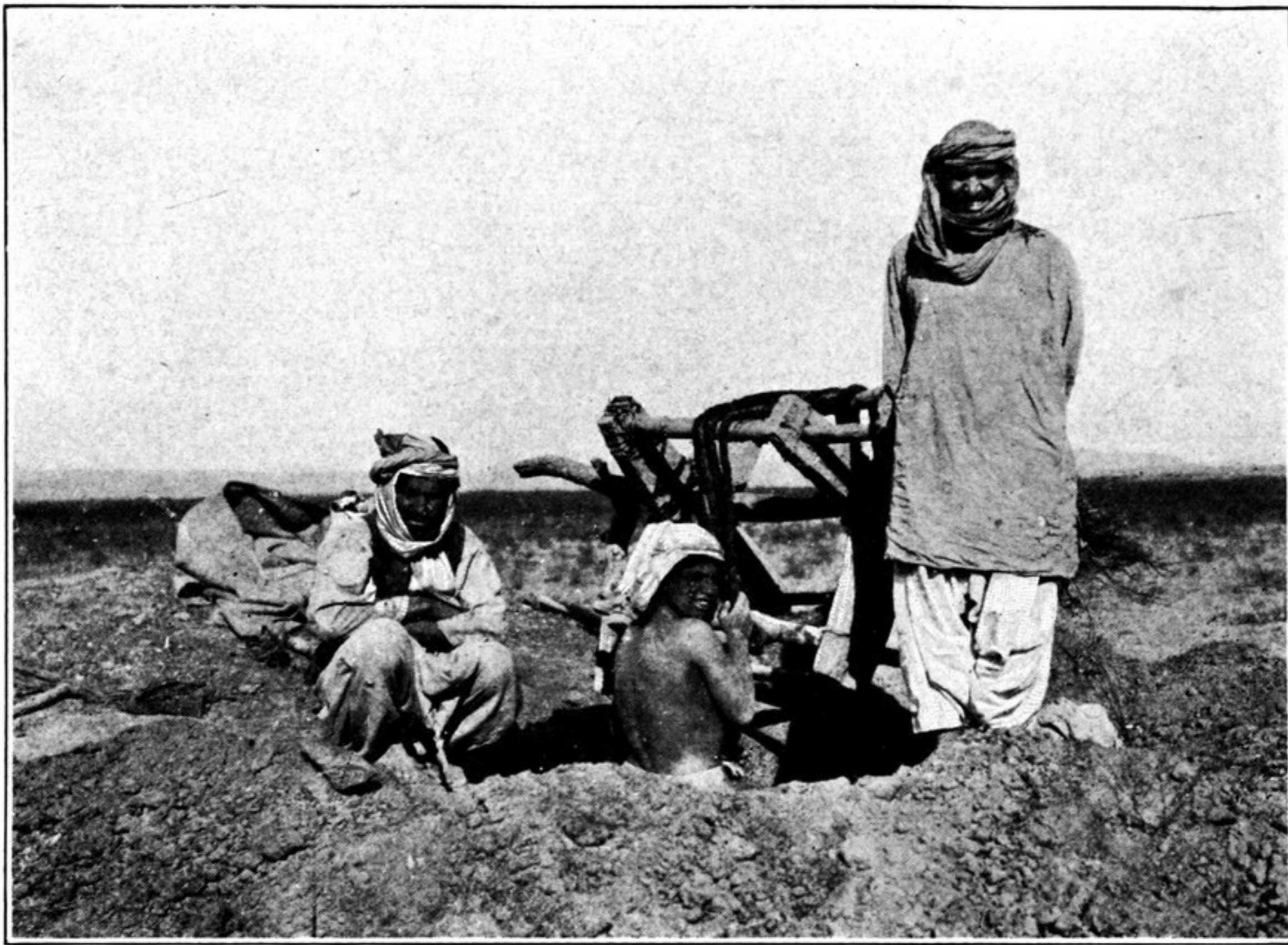
THREE PERSIAN MEN DIGGING A KARIZ WITH HALF OF A WINDLASS