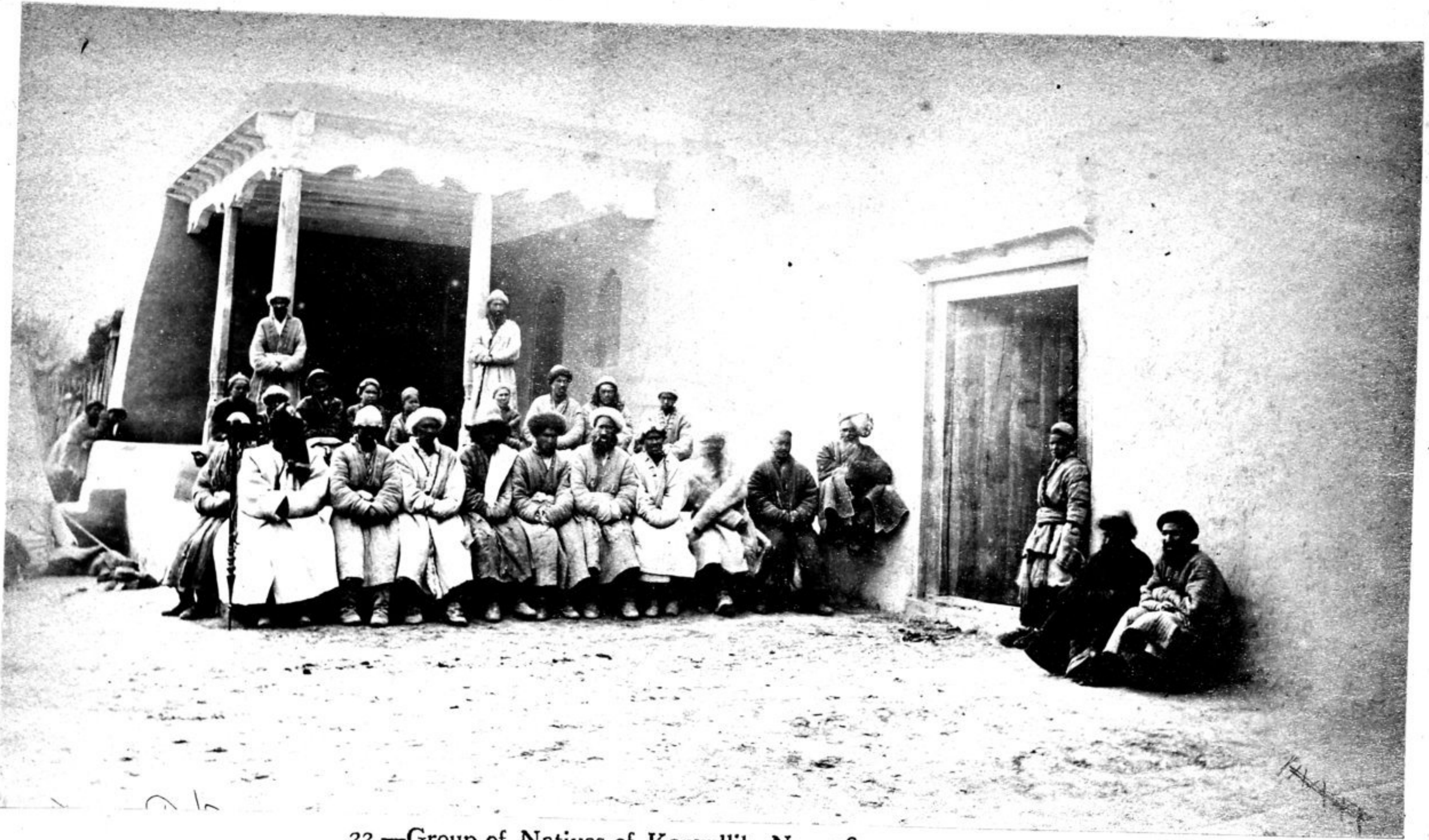
22.—Group of Natives of Kargullik, Nov. 1873.