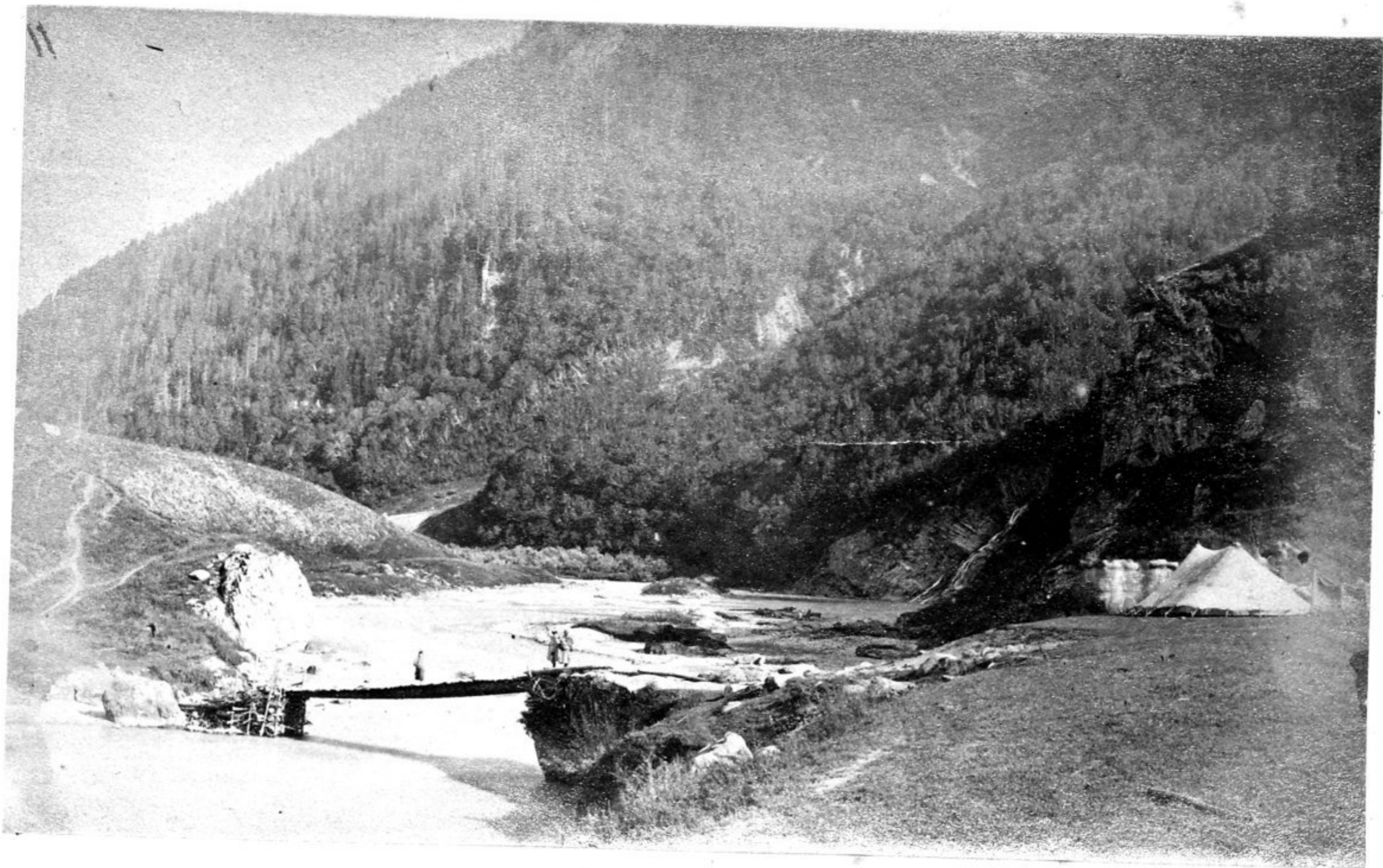
90.—Scinde Valley, Cashmere.