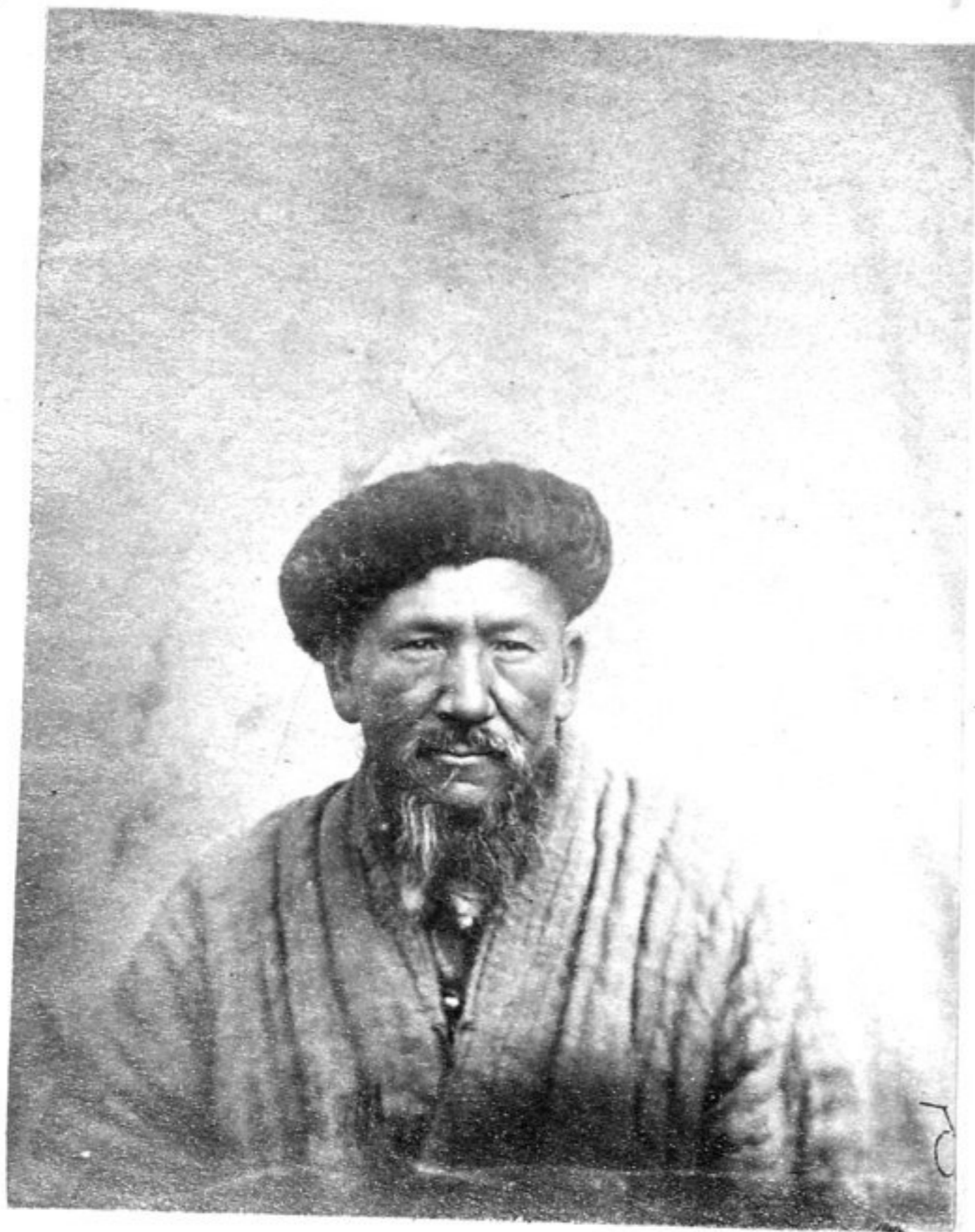
94.—A Hadji of Karghalik.