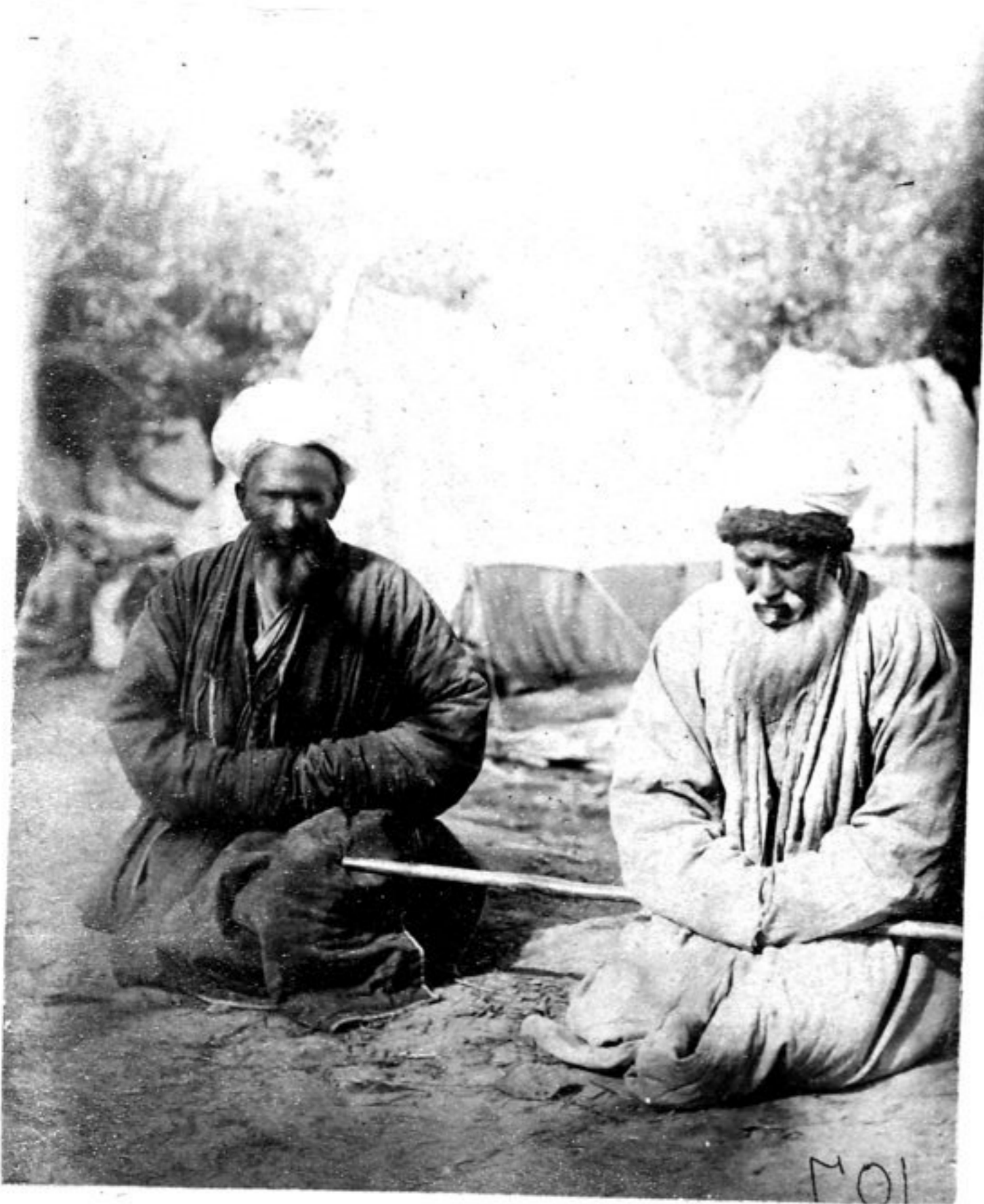
96.—Two Natives of Sanjwa.