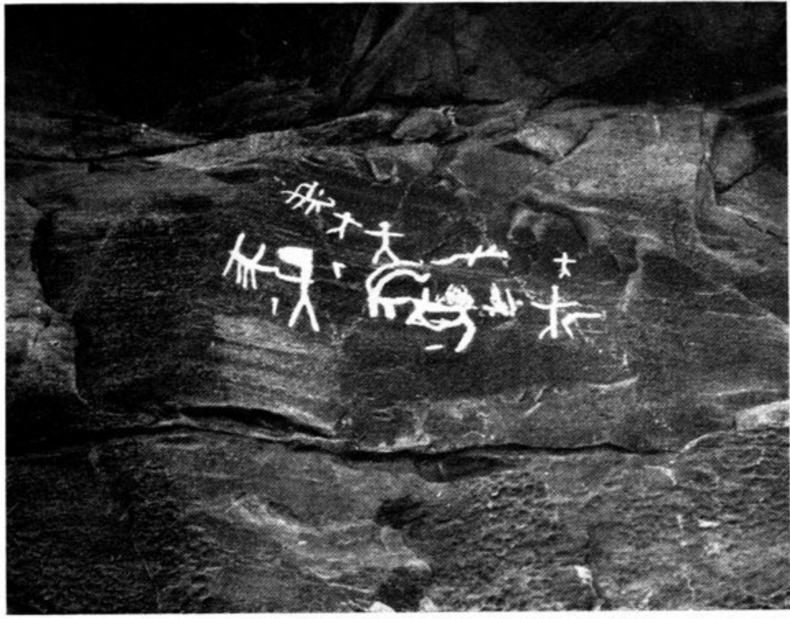
a. The first group of the Quruq-tagh rock carving.