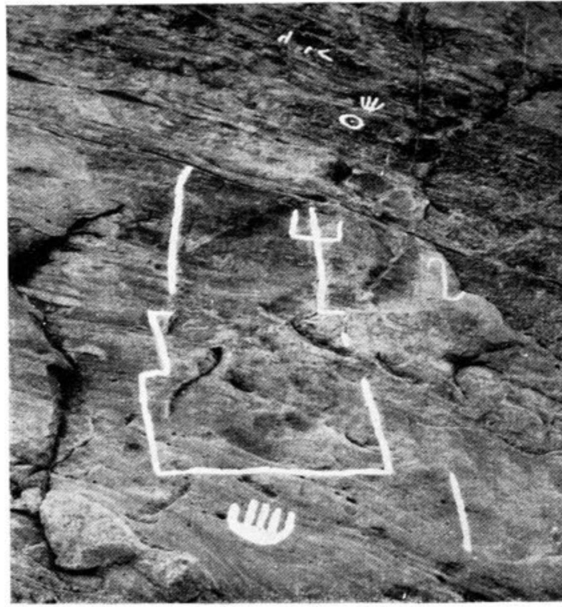
b. The last group furthest to the south.