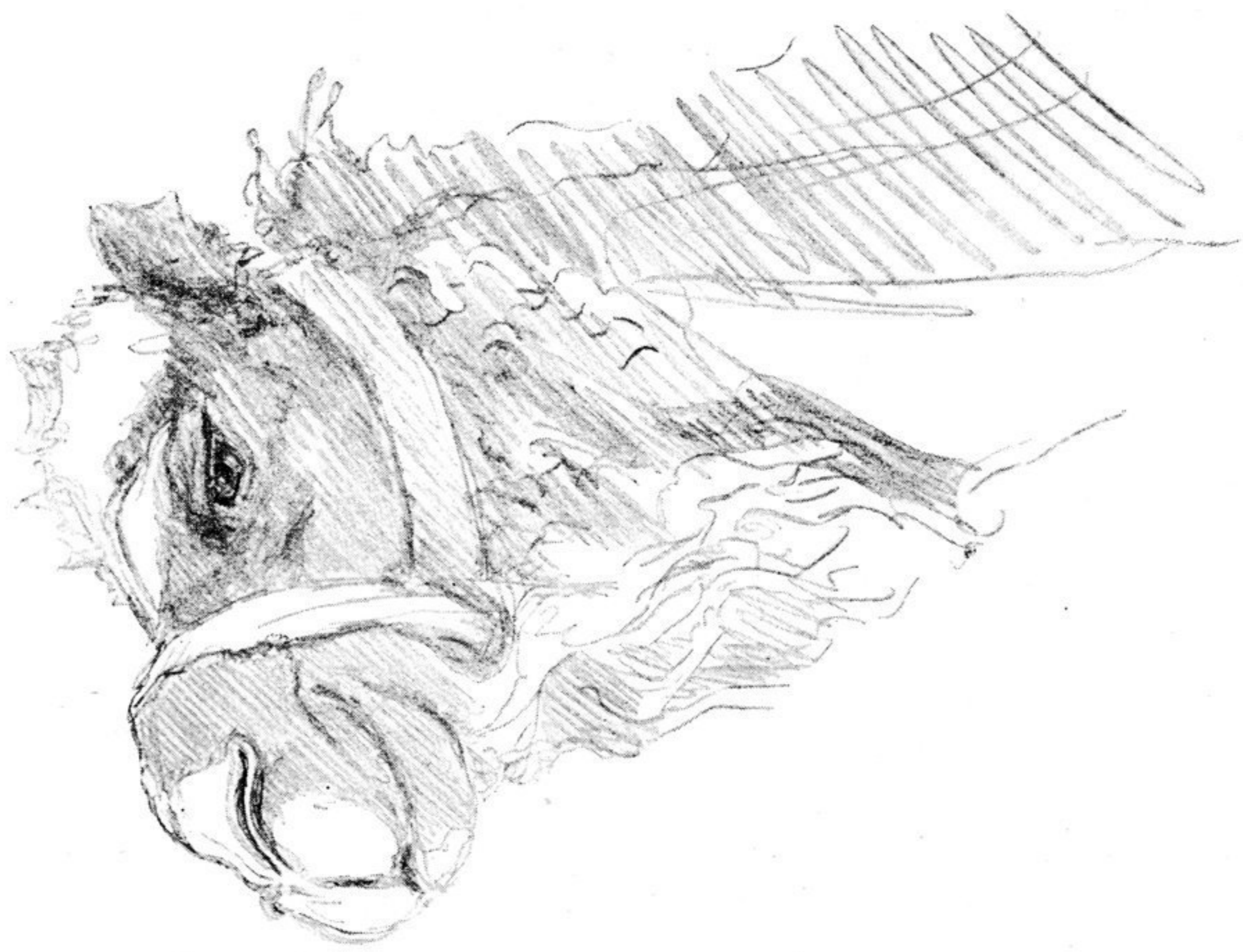
16. HEAD OF CAMEL.