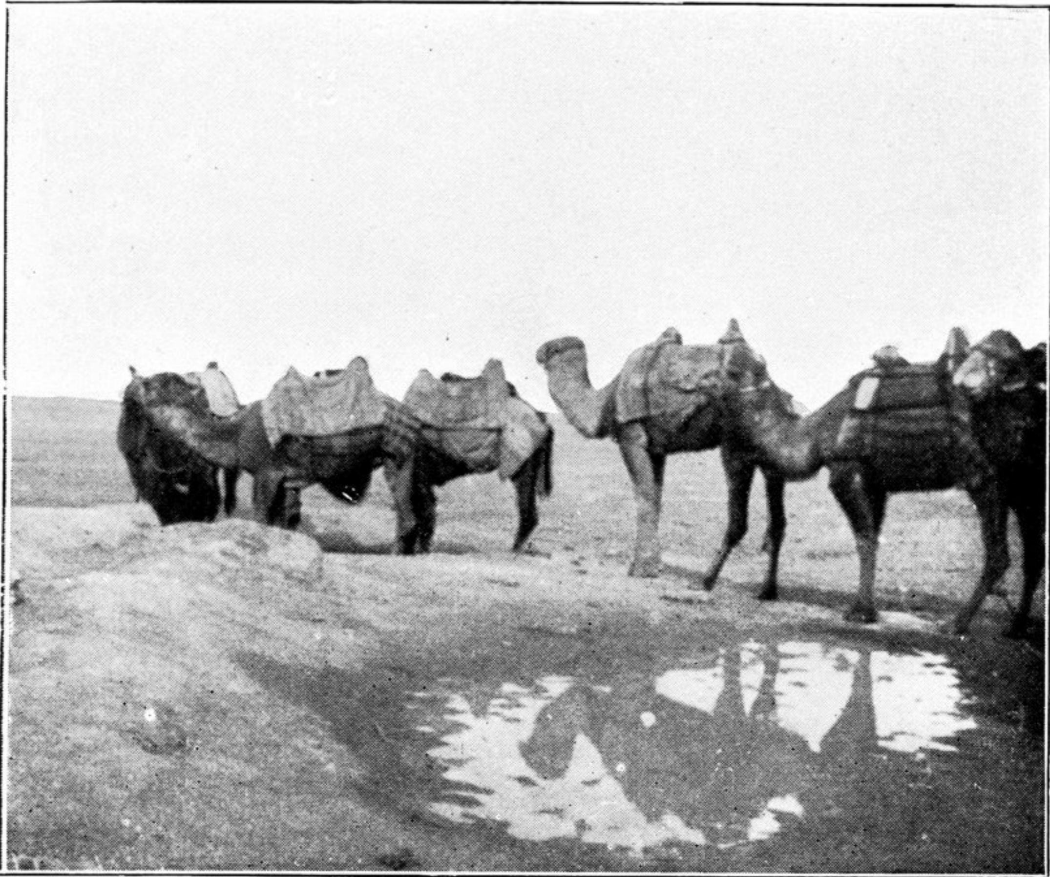
69. AN OPEN RESERVOIR OF RAIN-WATER.