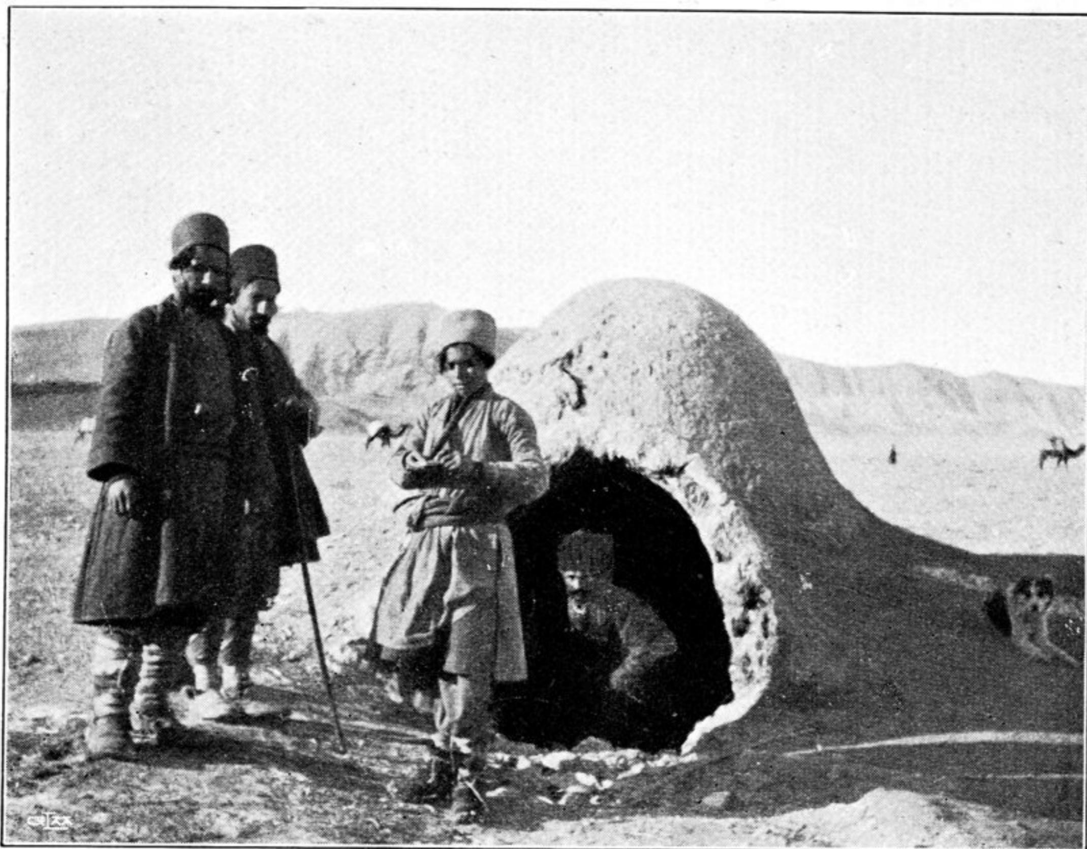
76. AN "ABAMBAR" OR WATER-CISTERN.