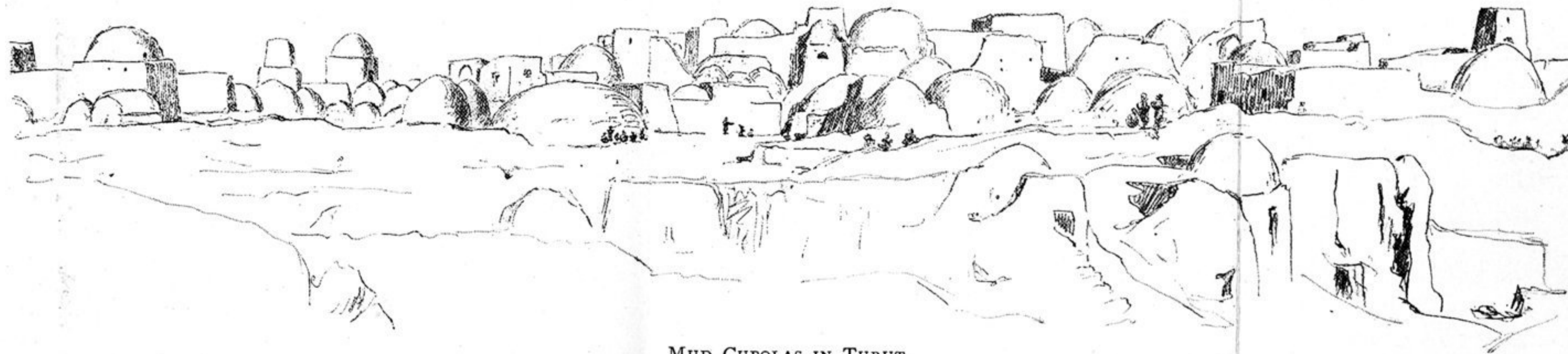
MUD CUPOLAS IN TURUT.