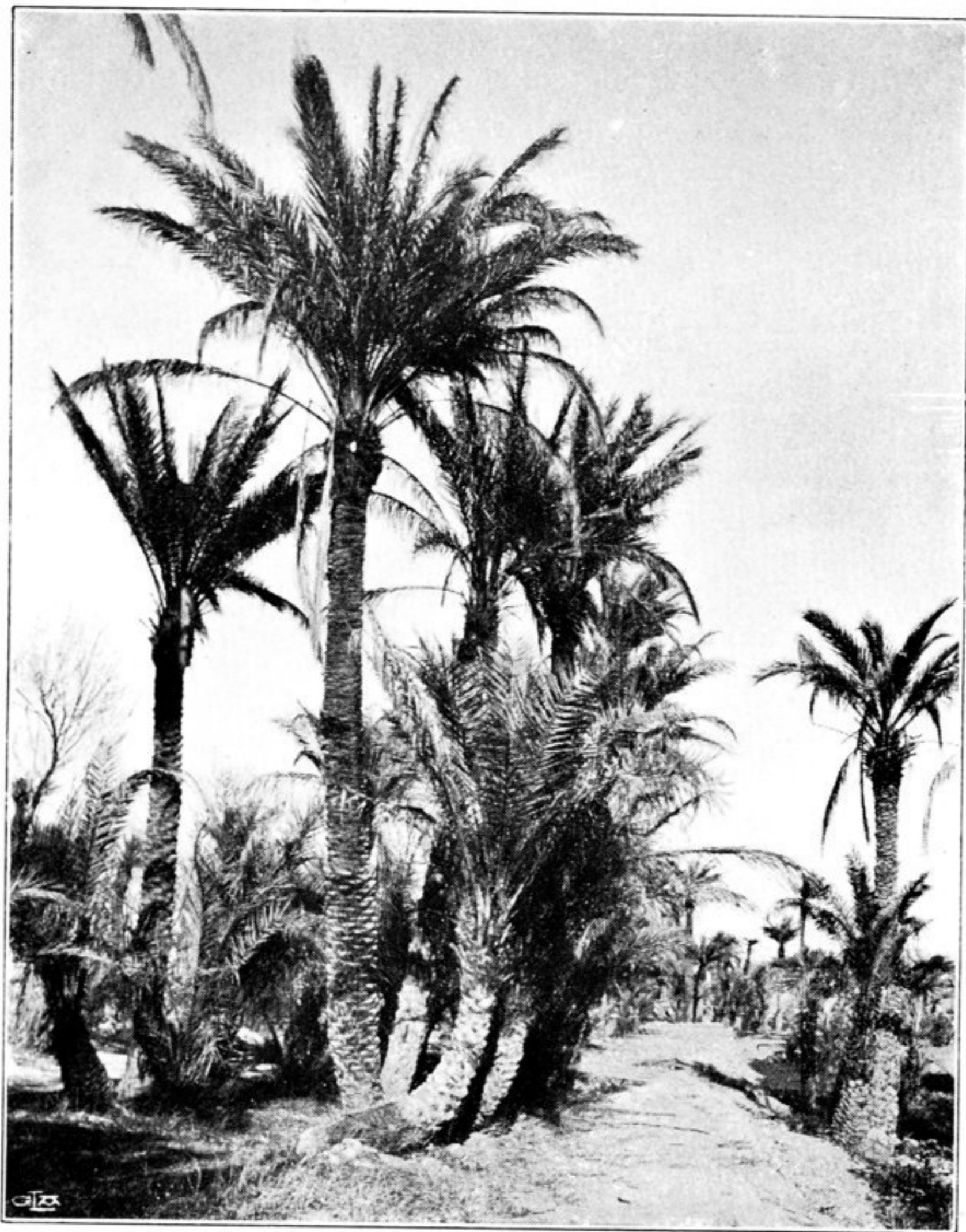
155. A CLUMP OF PALMS IN OUR GARDEN.