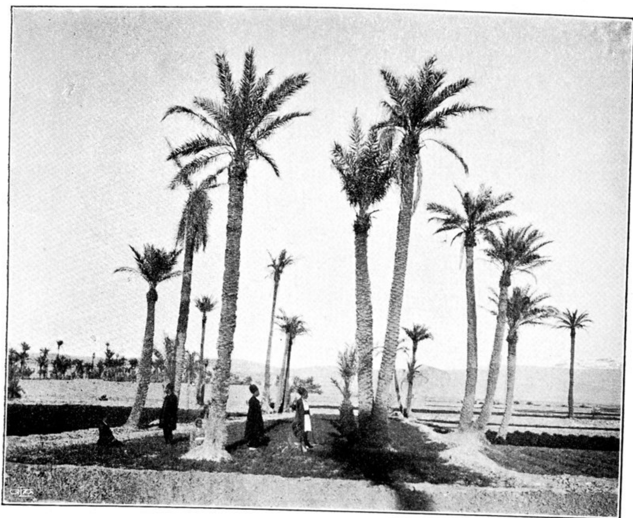
183. TALL PALMS IN THE OUTSKIRTS OF TEBBES.