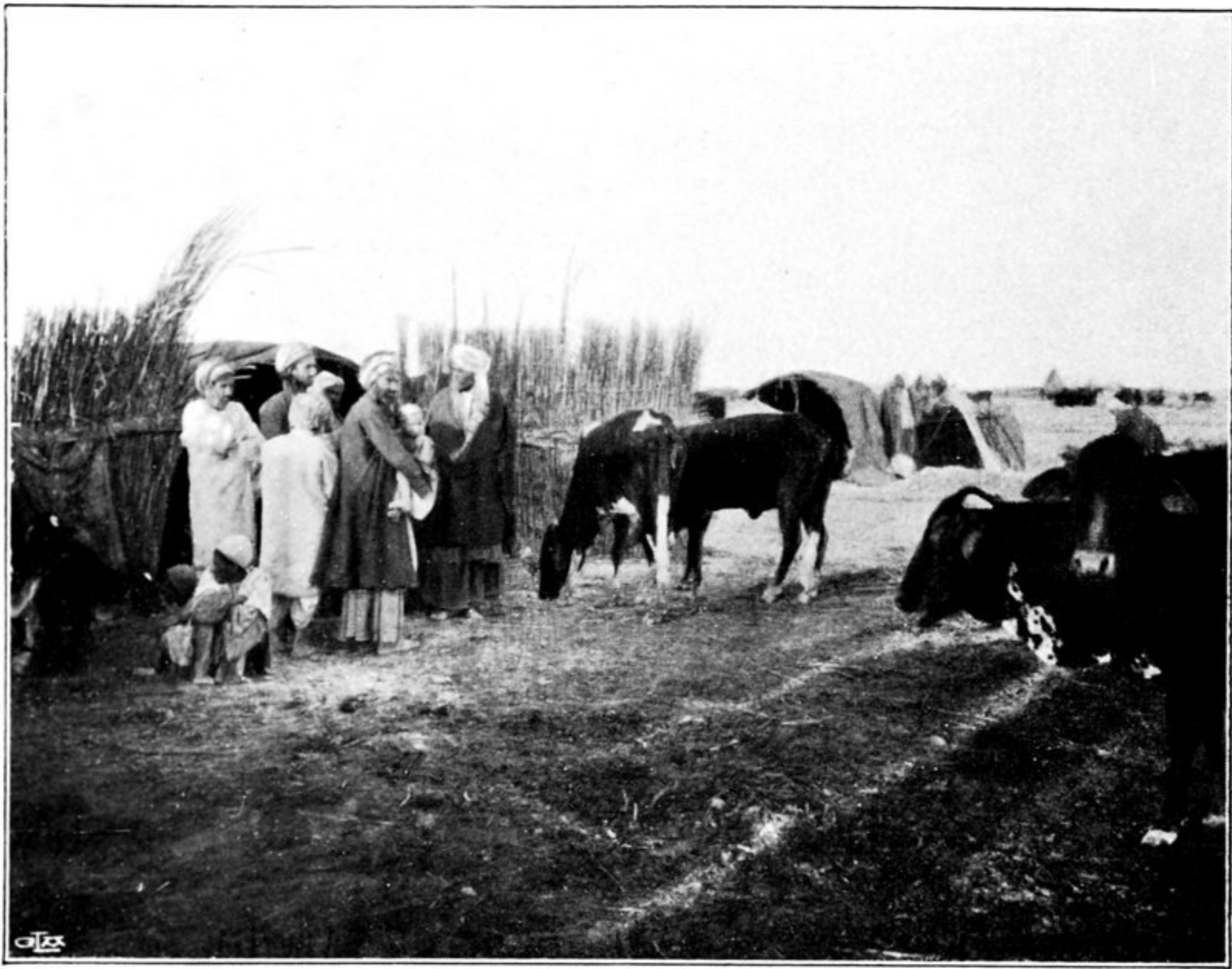
253. ANIMALS AT THE SHORE OF THE HAMUN.