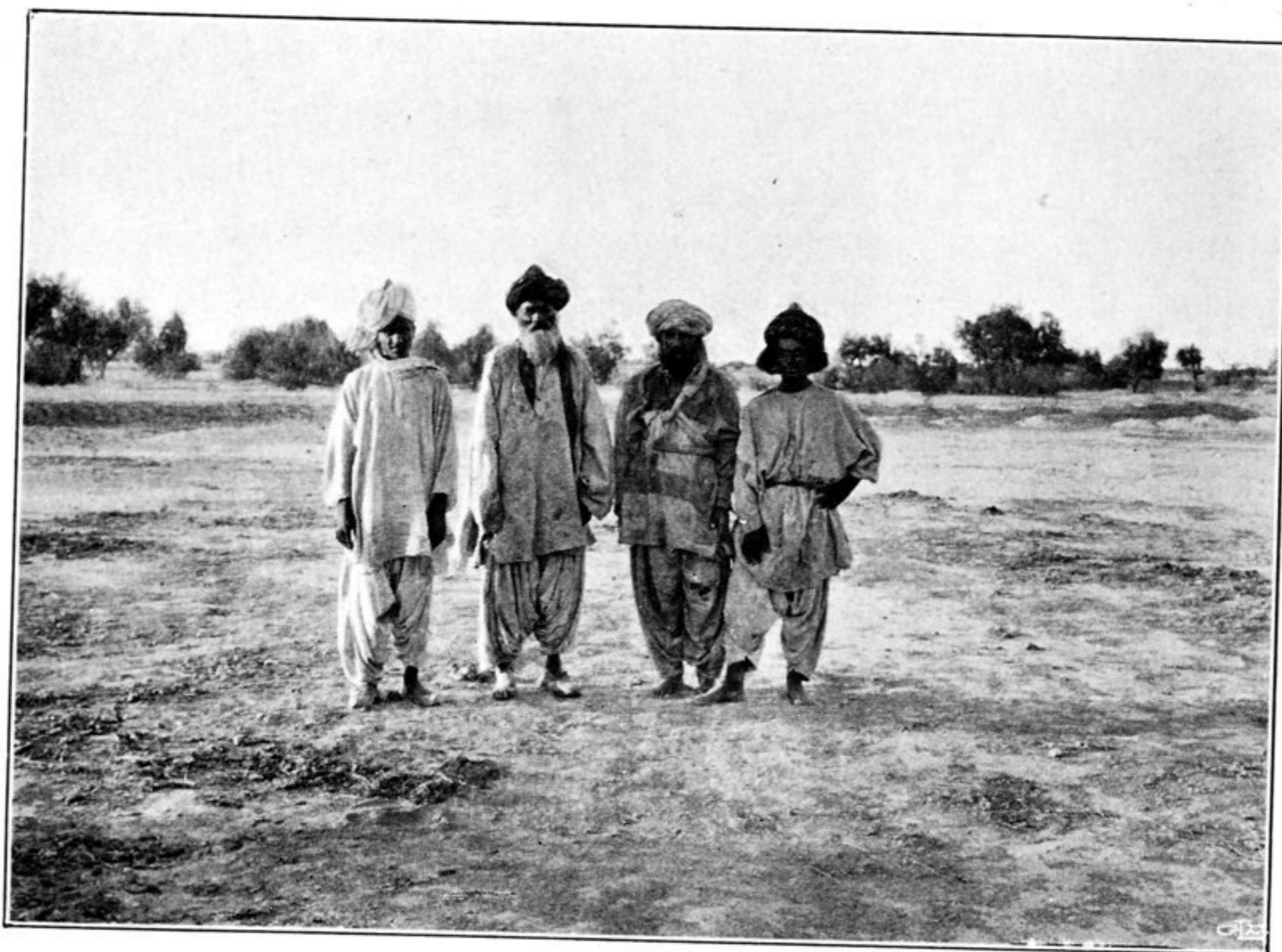
288. FOUR BALUCHIS.