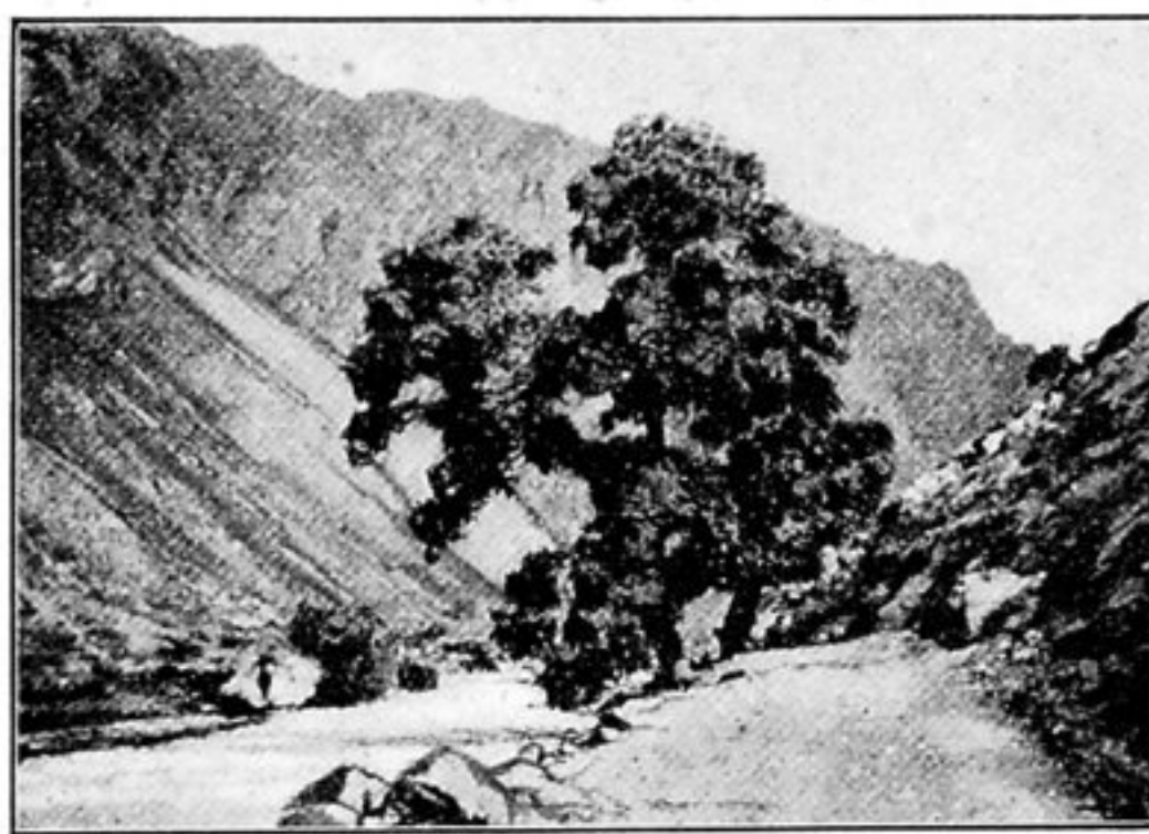
Fig. 84.—A Poplar Tree in the Taldic Valley.

All day we continued winding up the valley, frequently fording the stream. There were at first no trees on the hillsides, but frequent groups of picturesque mountain willows and crooked poplars along the edge of the stream (fig. 84). No wild animals were seen; only a few vultures and flocks of pigeons very like our domesticated variety. Toward the end of the day we entered a granite gorge and rode a long time above the roaring torrent. Occasional glimpses of the slopes high up above the canyon showed thin forests of bushy cedar trees.