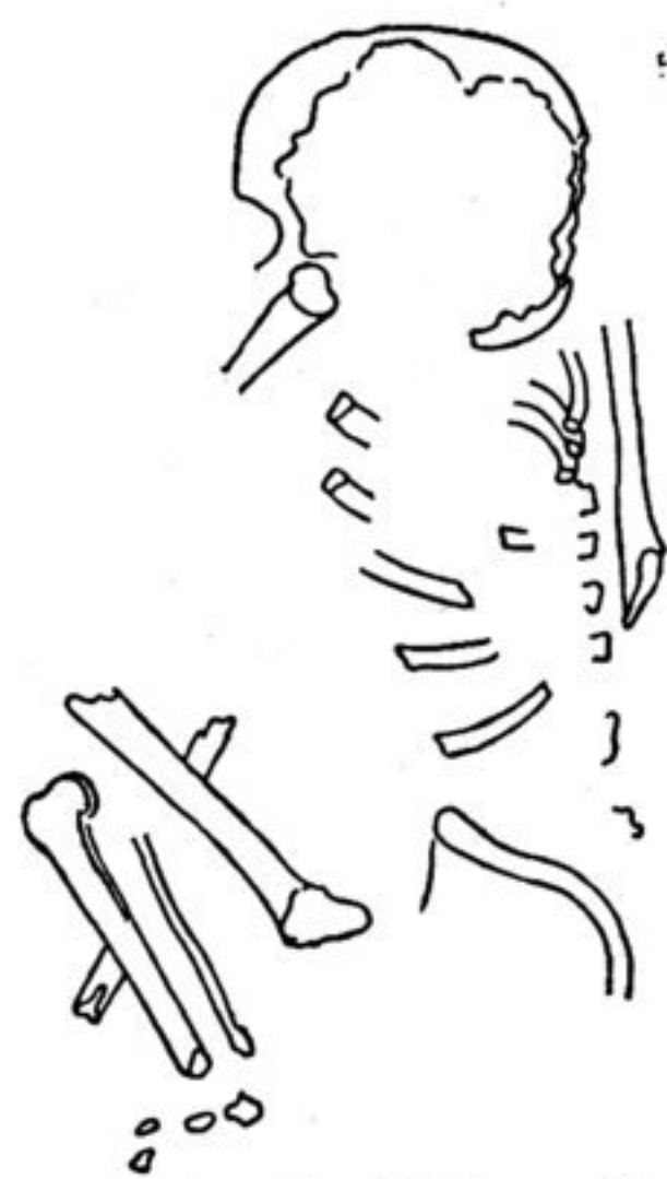
Fig. 535.—No. 2, Terrace I.