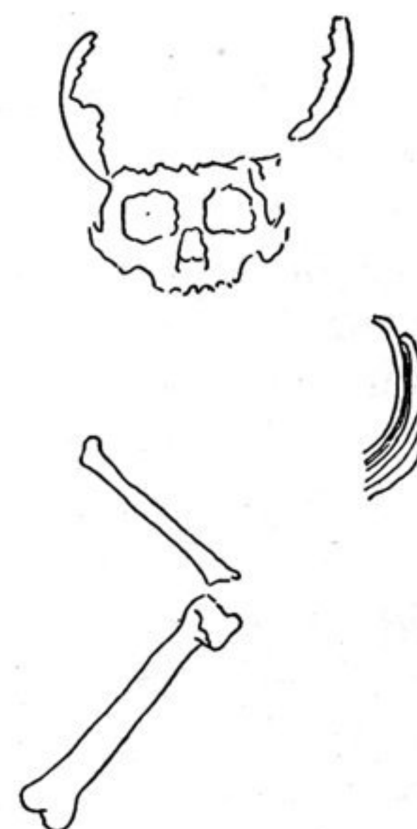
Fig. 536.—No. 3, Terrace I.

Skeleton No. 4. —The next burial was found at a height of +27 feet in the third terrace and more nearly approached adult size than any laid bare up to this time. The cranial sutures were not, however, closed and the ossification of the epiphyses was not complete in the limb-bones.