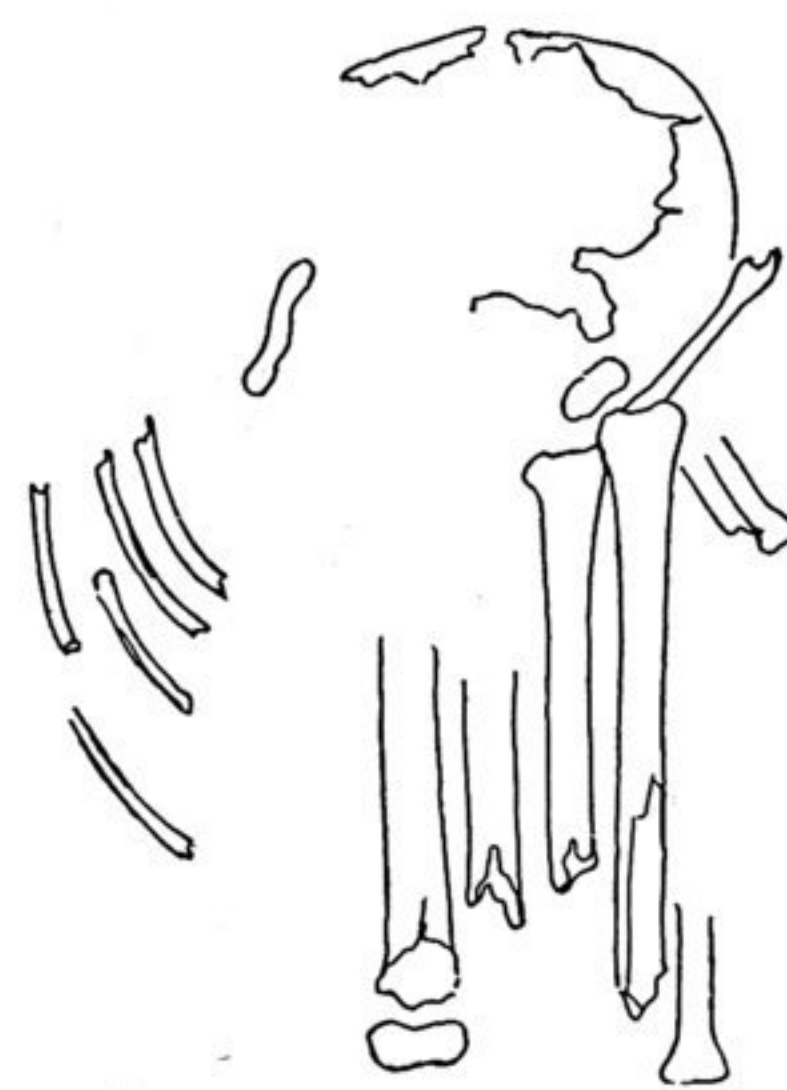
Fig. 548.—No. 28, Terrace C.

Skeleton No. 22 (γ). —Nearly due east from the last skeleton and about 8 feet from it we came upon the next burial at a level of +25 feet. The body was that of a child lying contracted on the left side, with the main axis of the trunk northeast and southwest. The position of many of the bones could be traced by their decayed remains, but little else could be learned. There remained no vestige of the left leg and foot or of the right lower arm and hand.