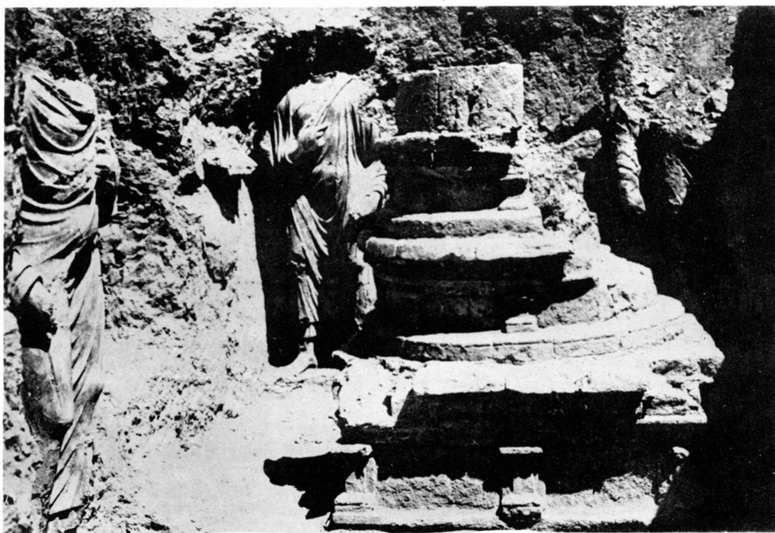
Fig. 2, a.