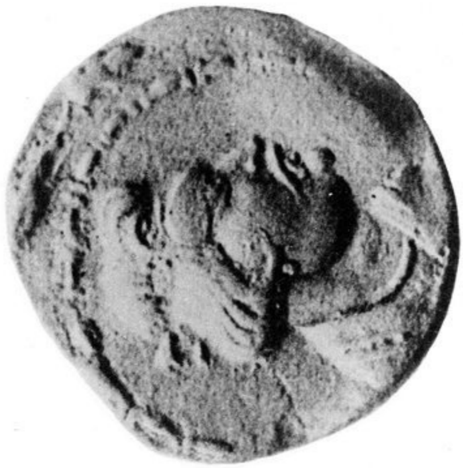
Fig. 12, a.