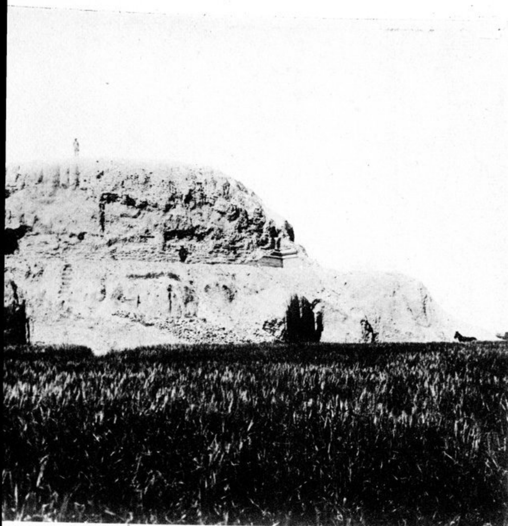
Fig. 59, a.