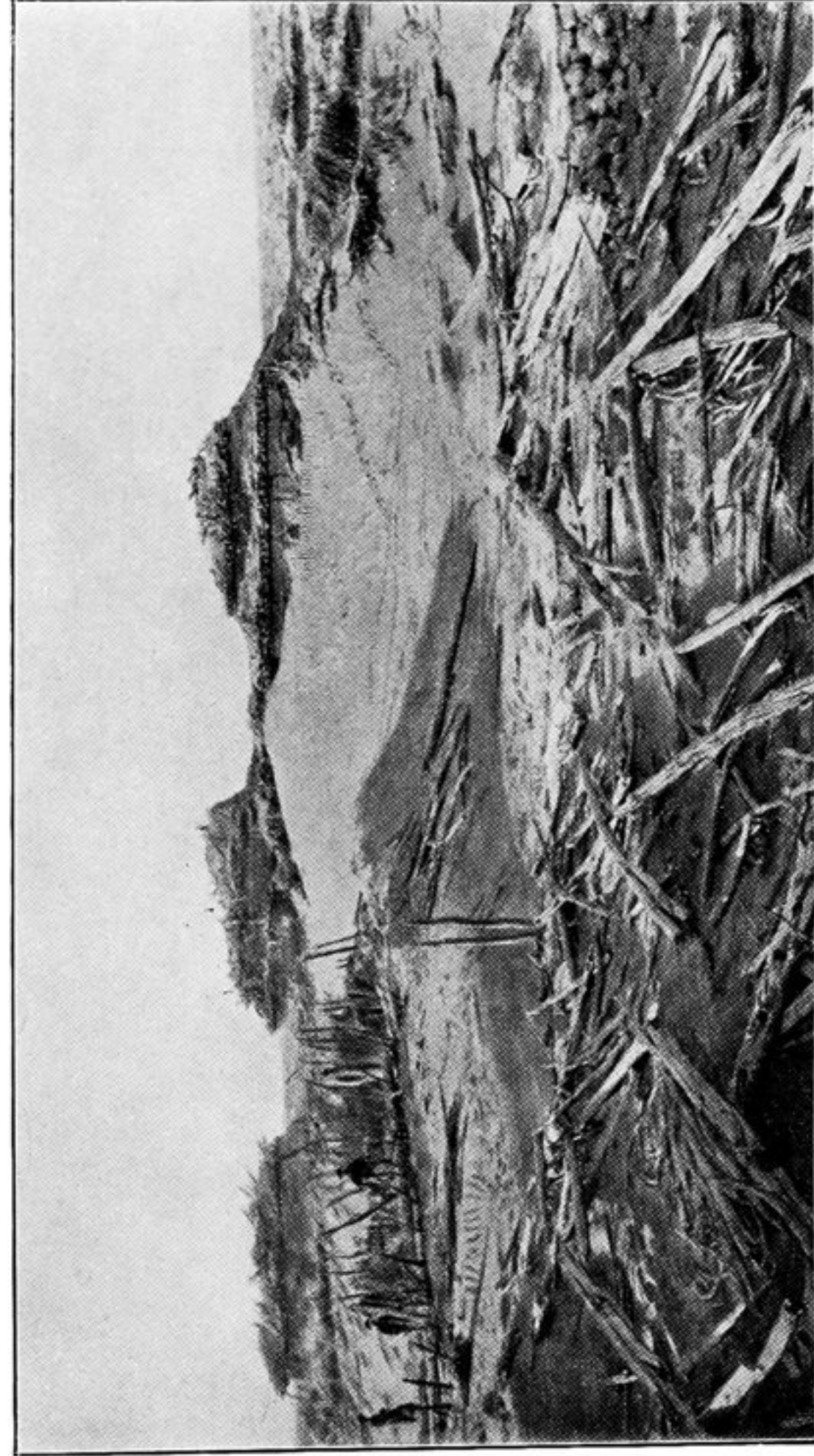
12. C.—WIND-ERODED WALLS AND INTERIOR OF RUINED FORT L. K., LOP DESERT (SEE PAGE 29). Timber debris of eroded quarters in foreground.