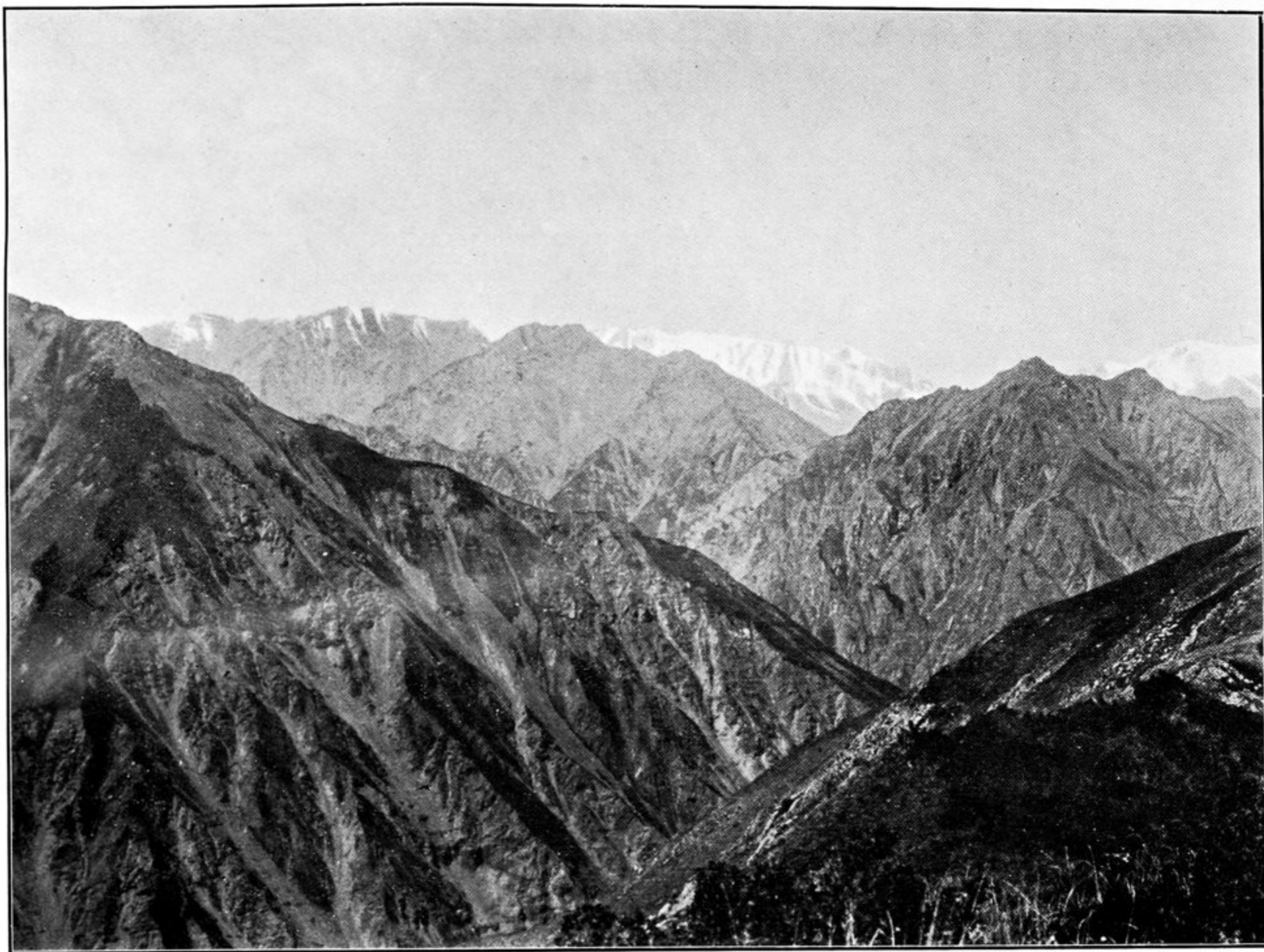
15. A.—RICHTHOFEN RANGE, FROM CHIN-TO-AN-SHEN PASS, LOOKING TO SOUTH-WEST (SEE PAGE 17).