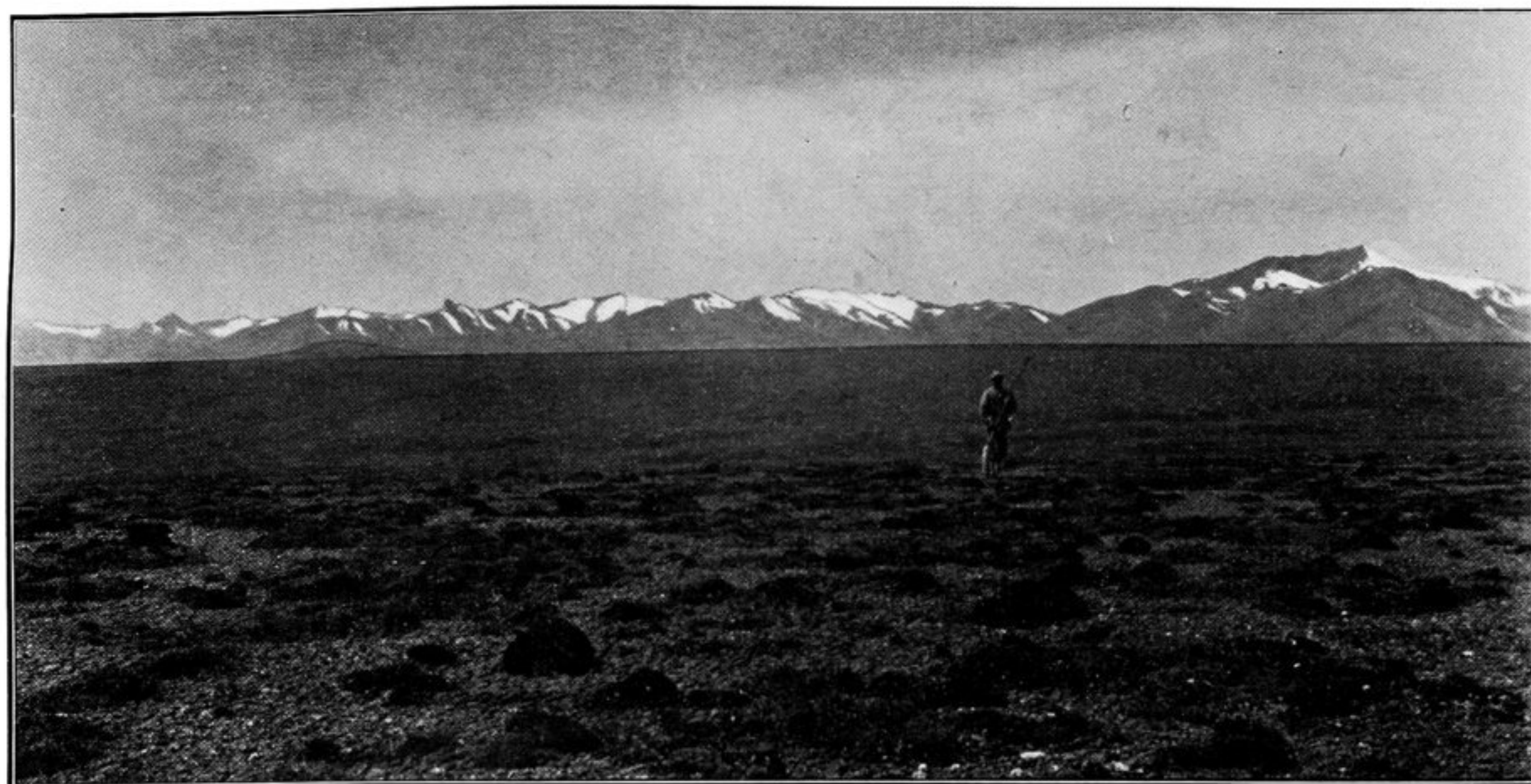
16. A. — TO-LAI-SHAN RANGE, LOOKING SOUTH FROM WATERSHED ABOVE KAN-CHOU R. SOURCES (SEE PAGE 17).