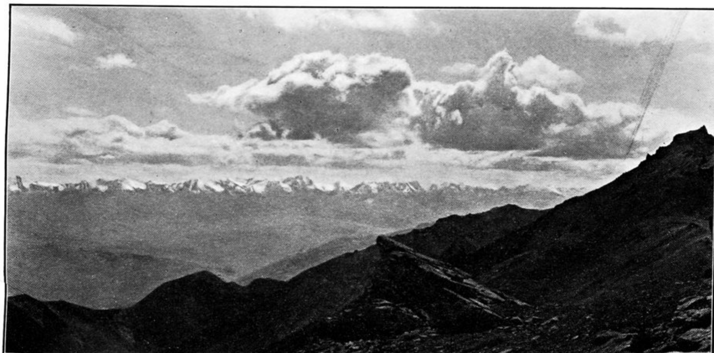
16. C. — ALEXANDER III. RANGE, LOOKING SOUTH-WEST FROM ABOVE HUO-NING-TO PASS ACROSS PEI-TA-HO VALLEY (SEE PAGE 17).