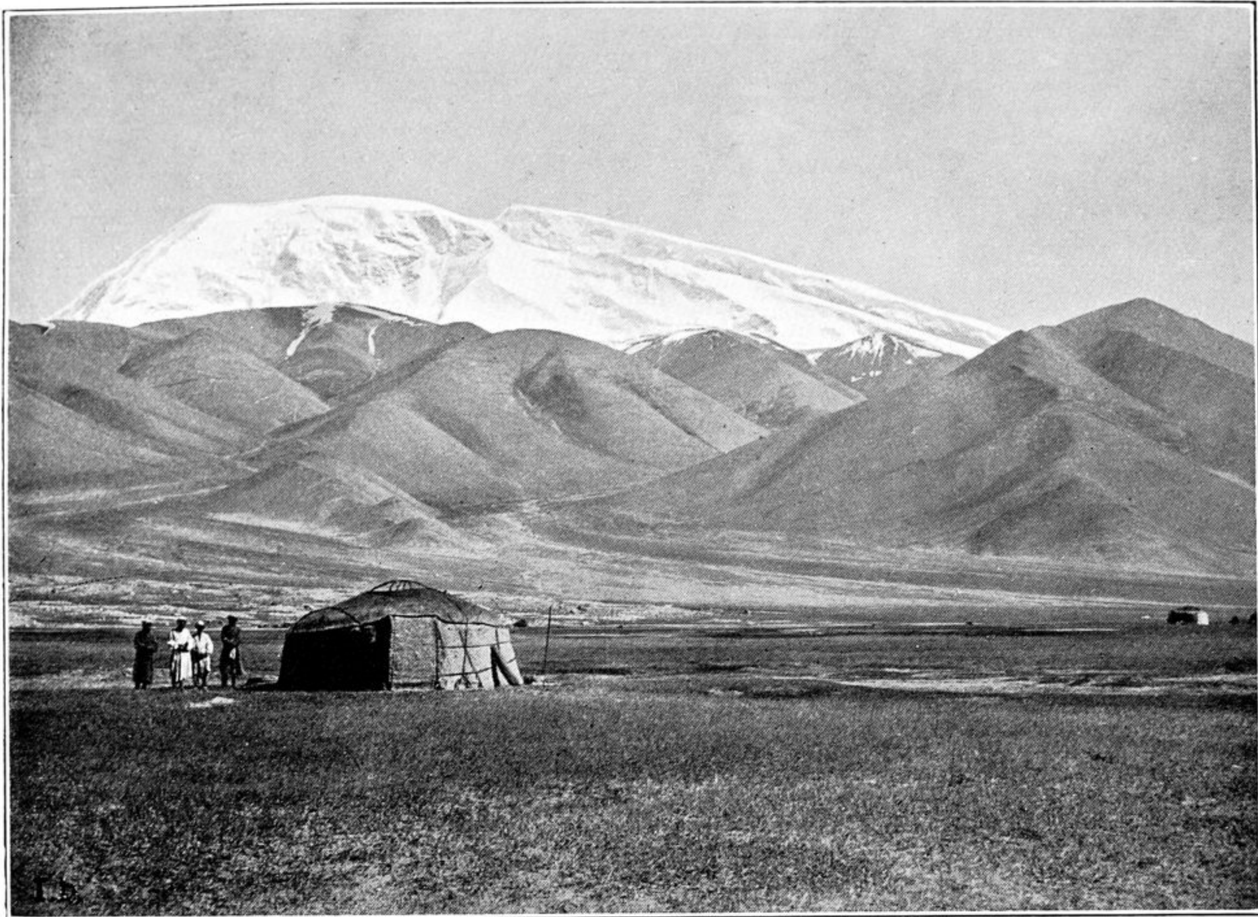
1. MUZ-TAGH-ATA PEAK SEEN FROM SOUTHERN END OF LITTLE KARA-KÖL LAKE. Kirghiz felt tent in foreground.