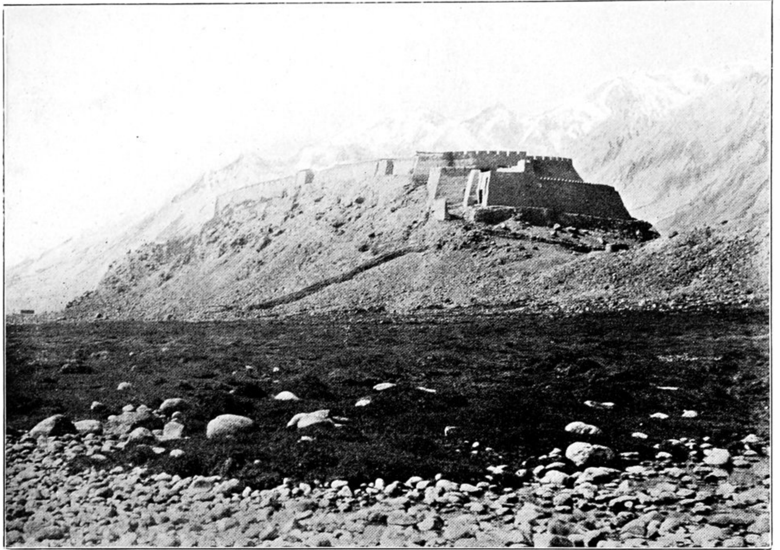
17. CHINESE FORT OF TASH-KURGHAN, SEEN FROM NEAR LEFT BANK OF RIVER.