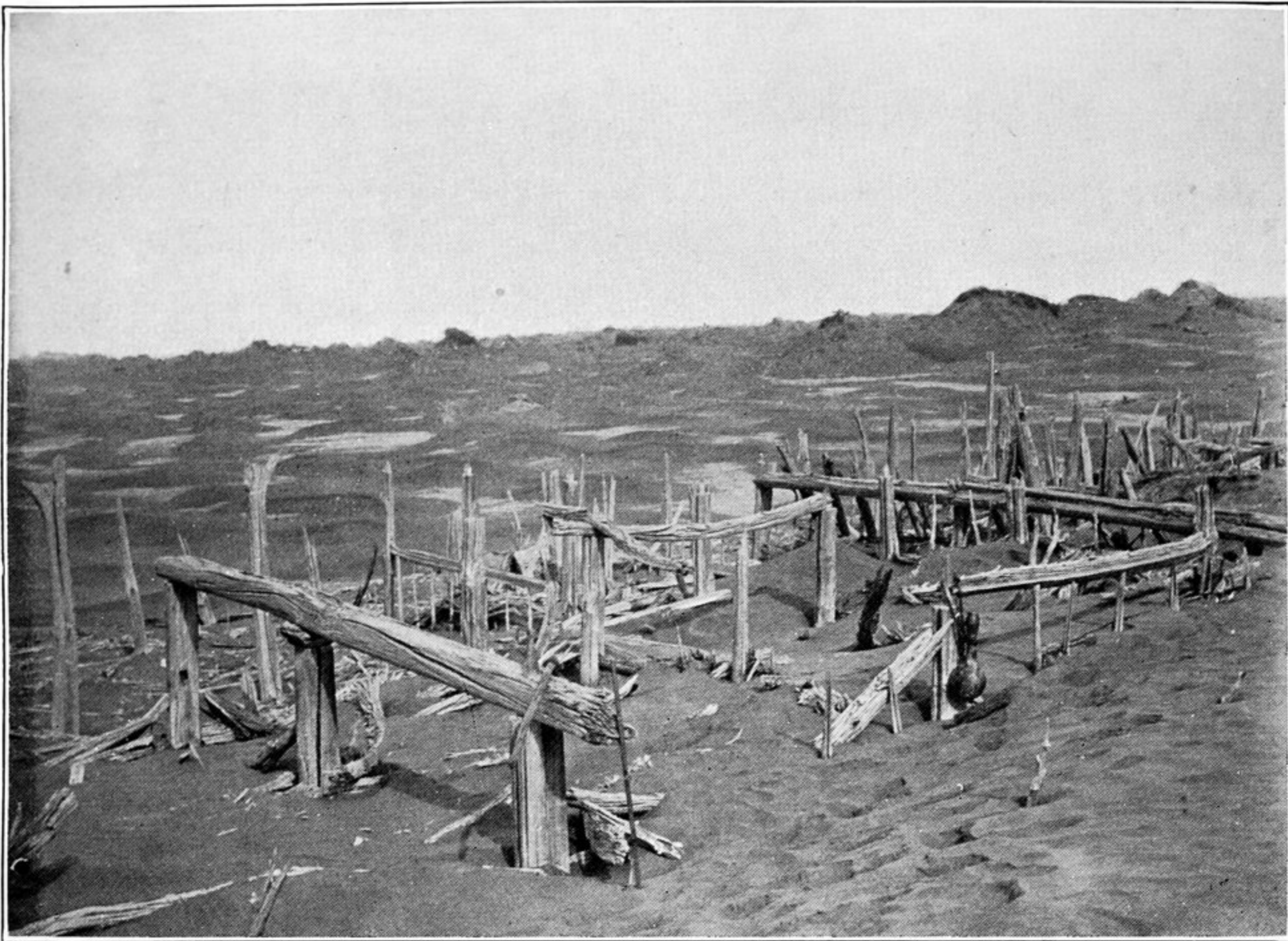
35. PORTION OF ANCIENT RESIDENCE, NIYA SITE, BEFORE EXCAVATION.