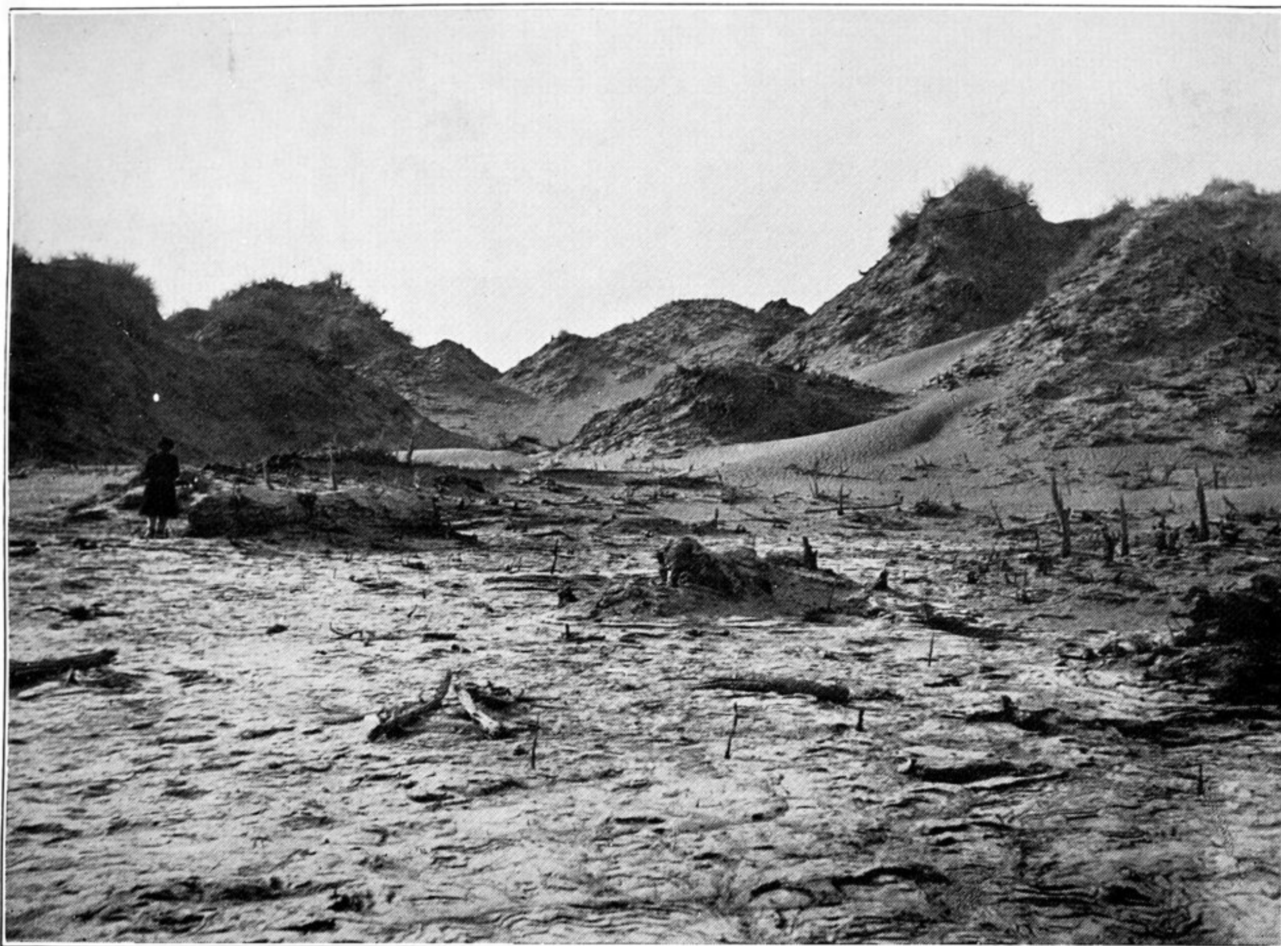
49. REMAINS OF ANCIENT VINEYARD WITH POSTS CARRYING TRELLIS, NIYA SITE.