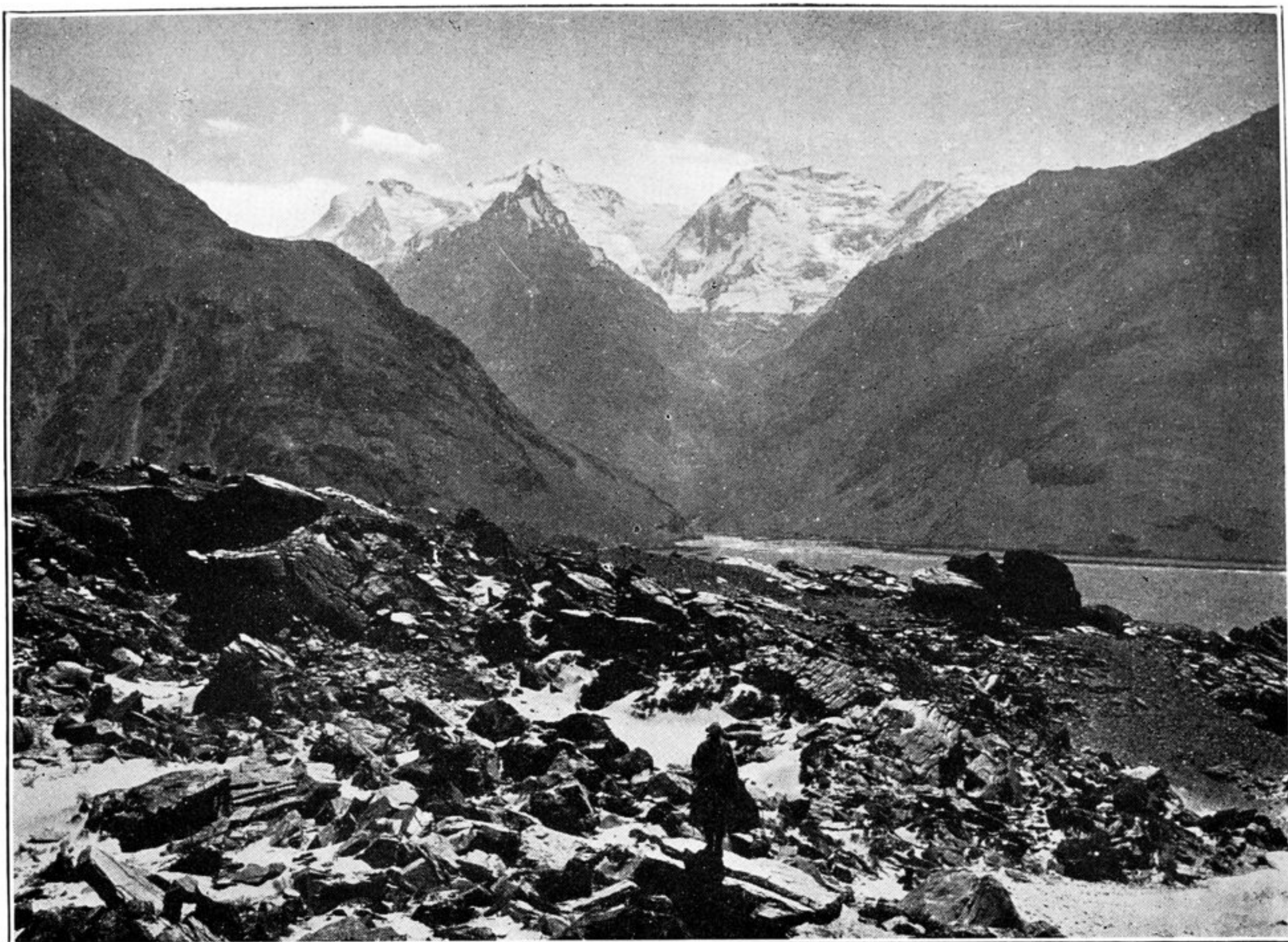
138. HINDUKUSH PEAKS ABOVE ISHMARG, SEEN ACROSS AB-I-PANJA.