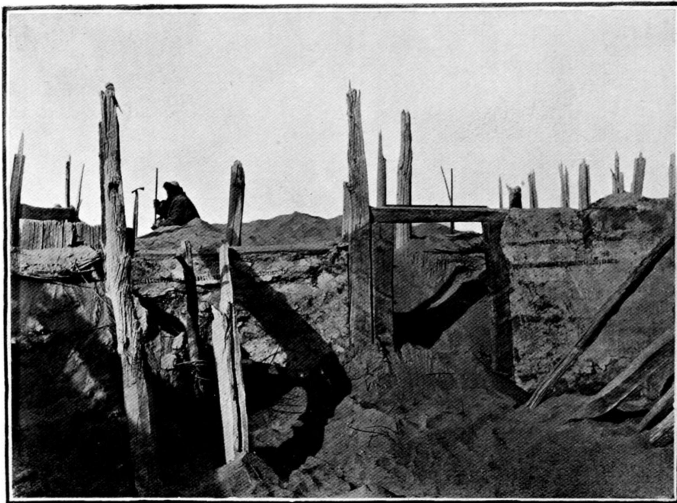
NORTH WALL OF HALL IN RUINED HOUSE N. III, NIYA SITE, AFTER EXCAVATION.