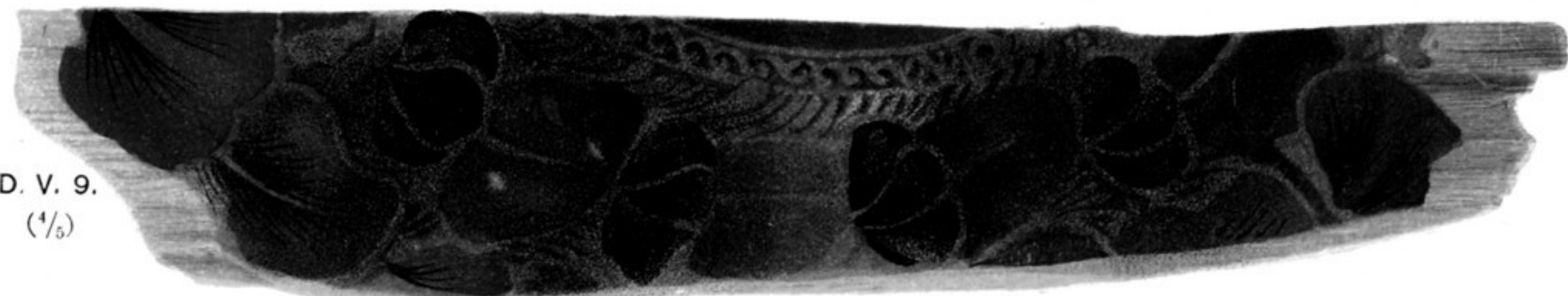
D. V. 9. (1/6)