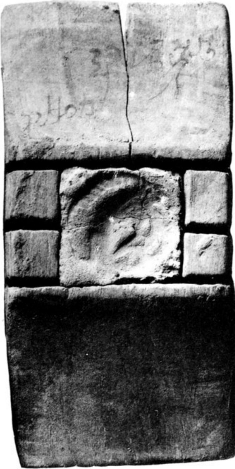
N. xv. 38.