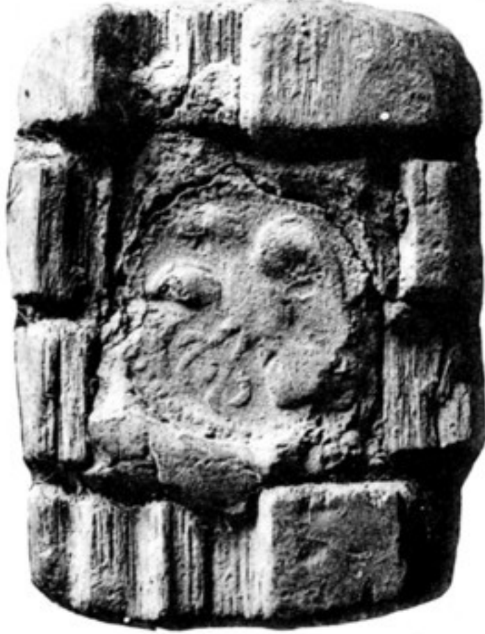
N. xv. 133. a.