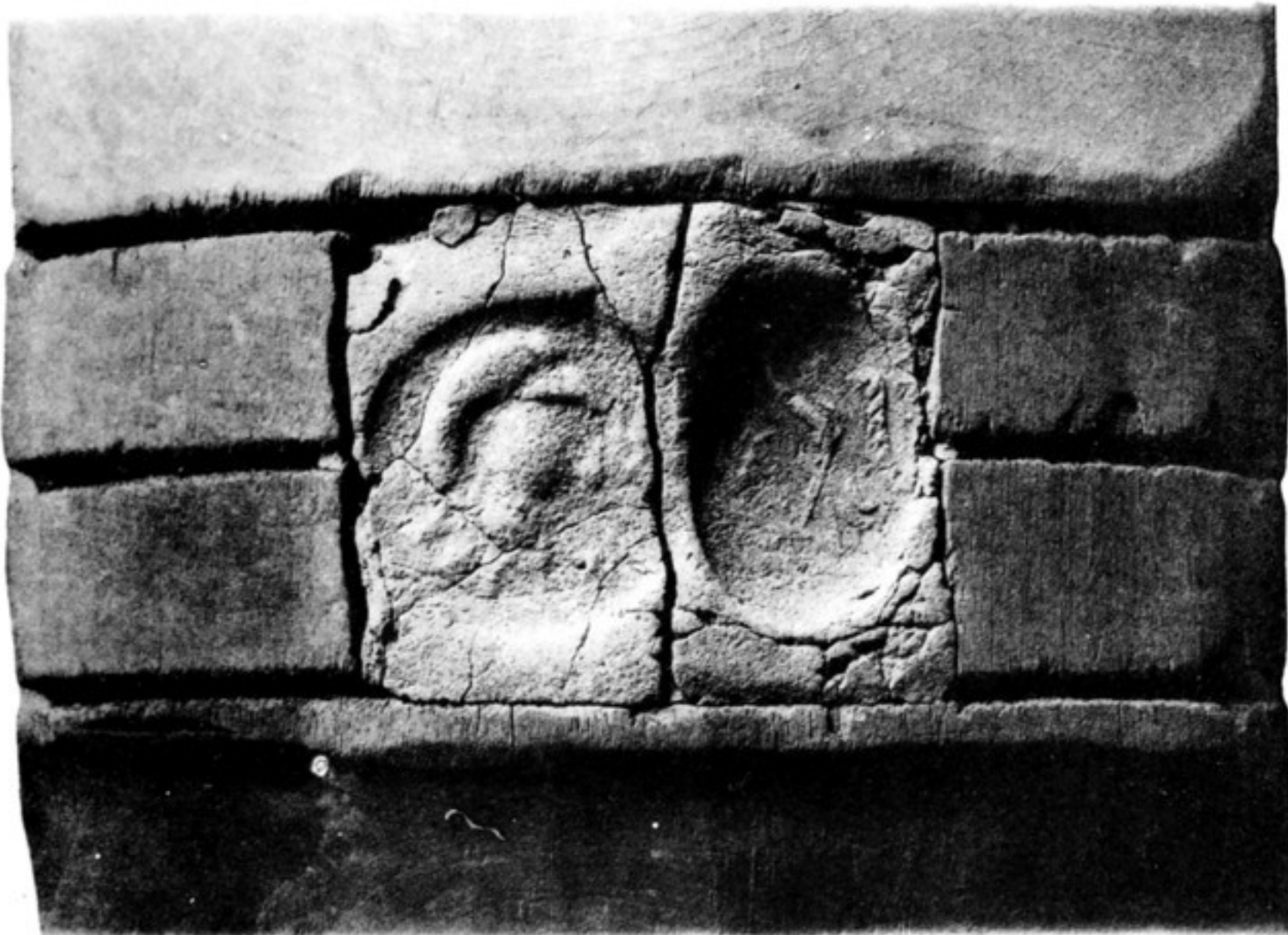
N. xxiii. 1.