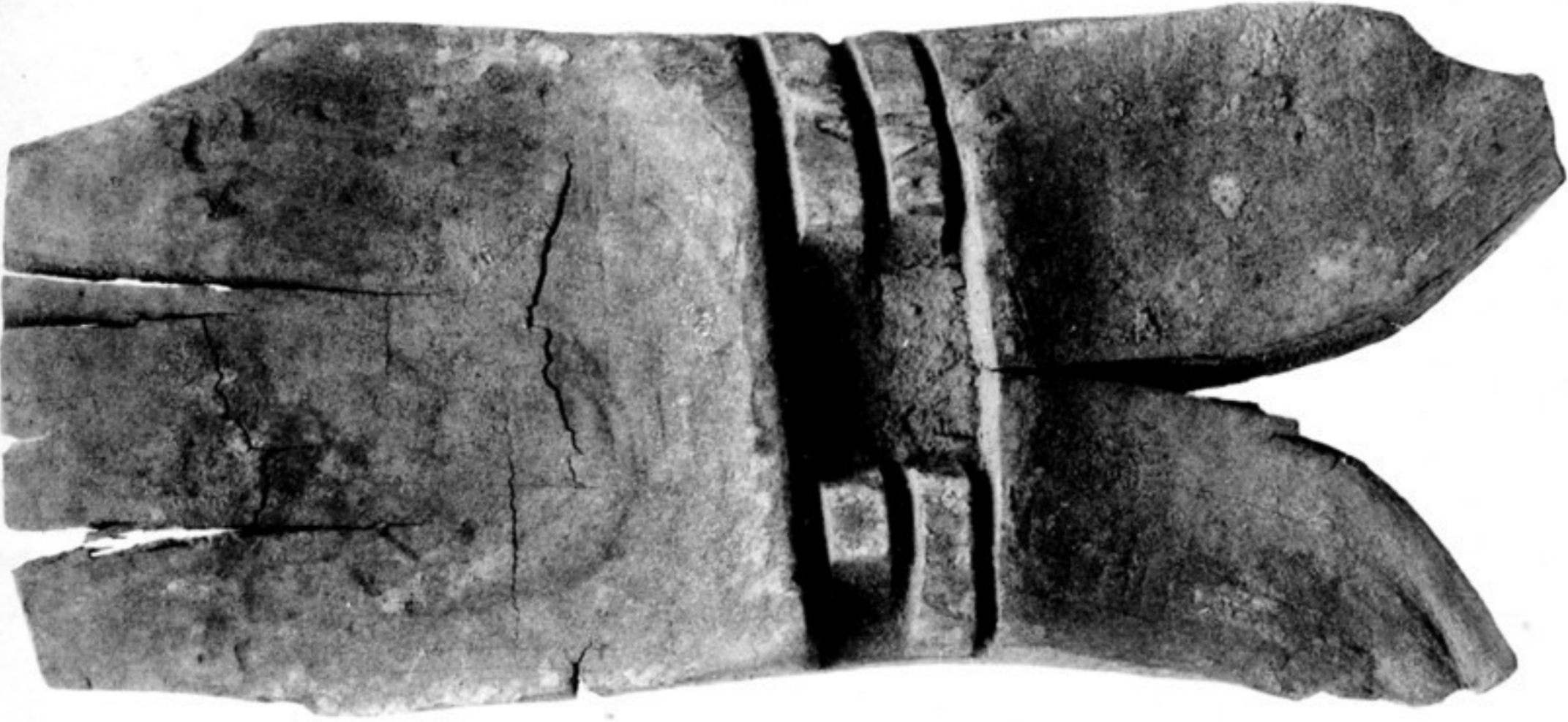
RECTANG. COVERING-TABLET SPLIT AND PERISHED.