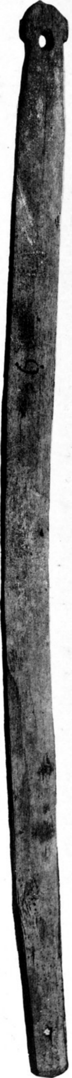
SLIP OF WOOD FOR WRITING.