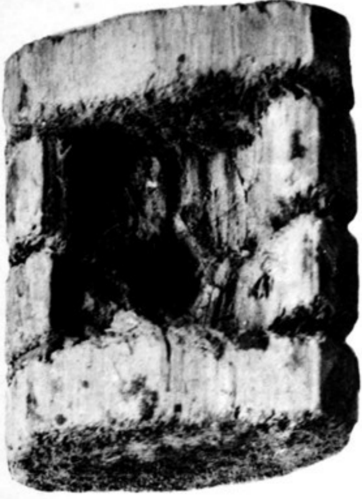
WOODEN SEAL CASE.