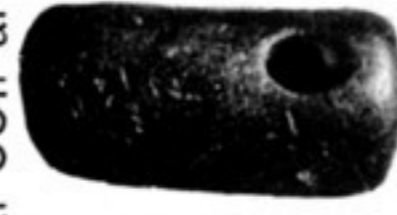
PIECE OF CHINESE INK.