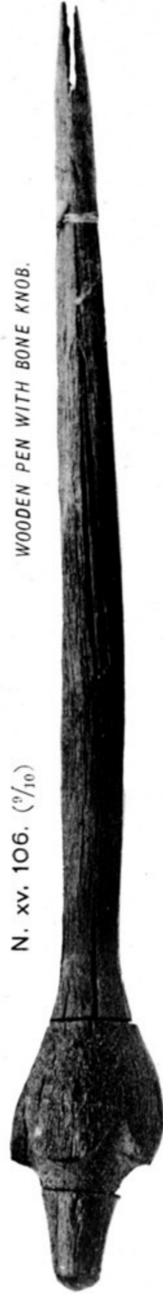
WOODEN PEN WITH BONE KNOB.