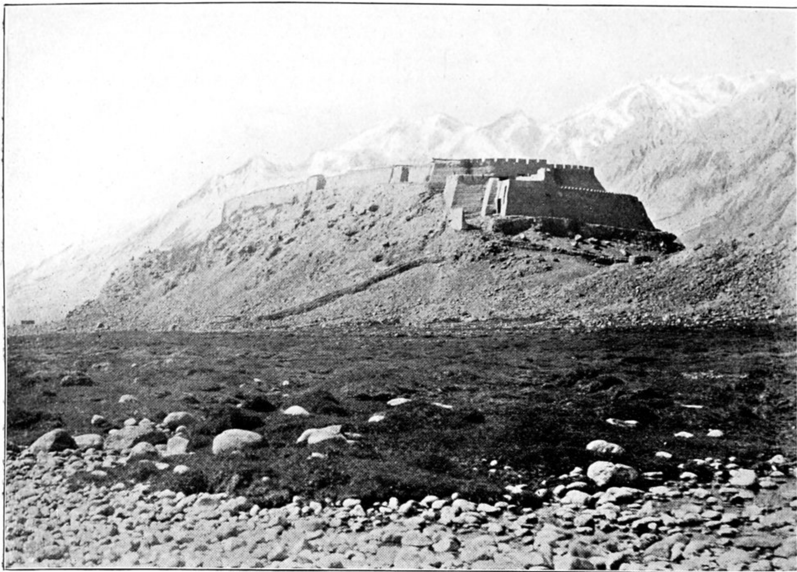
34. CHINESE FORT OF TASH-KURGHAN SEEN FROM NEAR LEFT BANK OF RIVER.