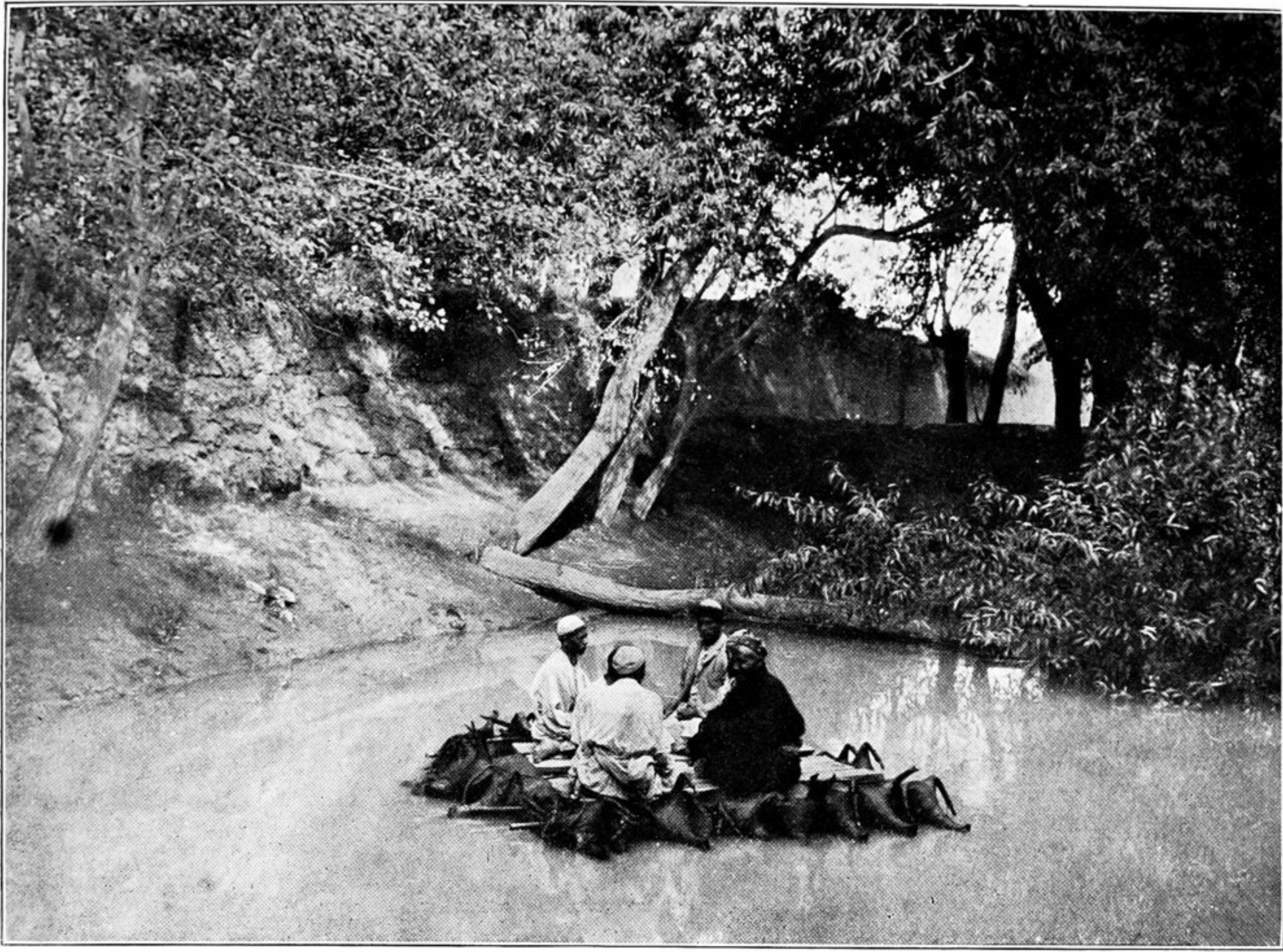
53. TESTING RAFT OF INFLATED SKINS ON A TANK OF NAR-BAGH.