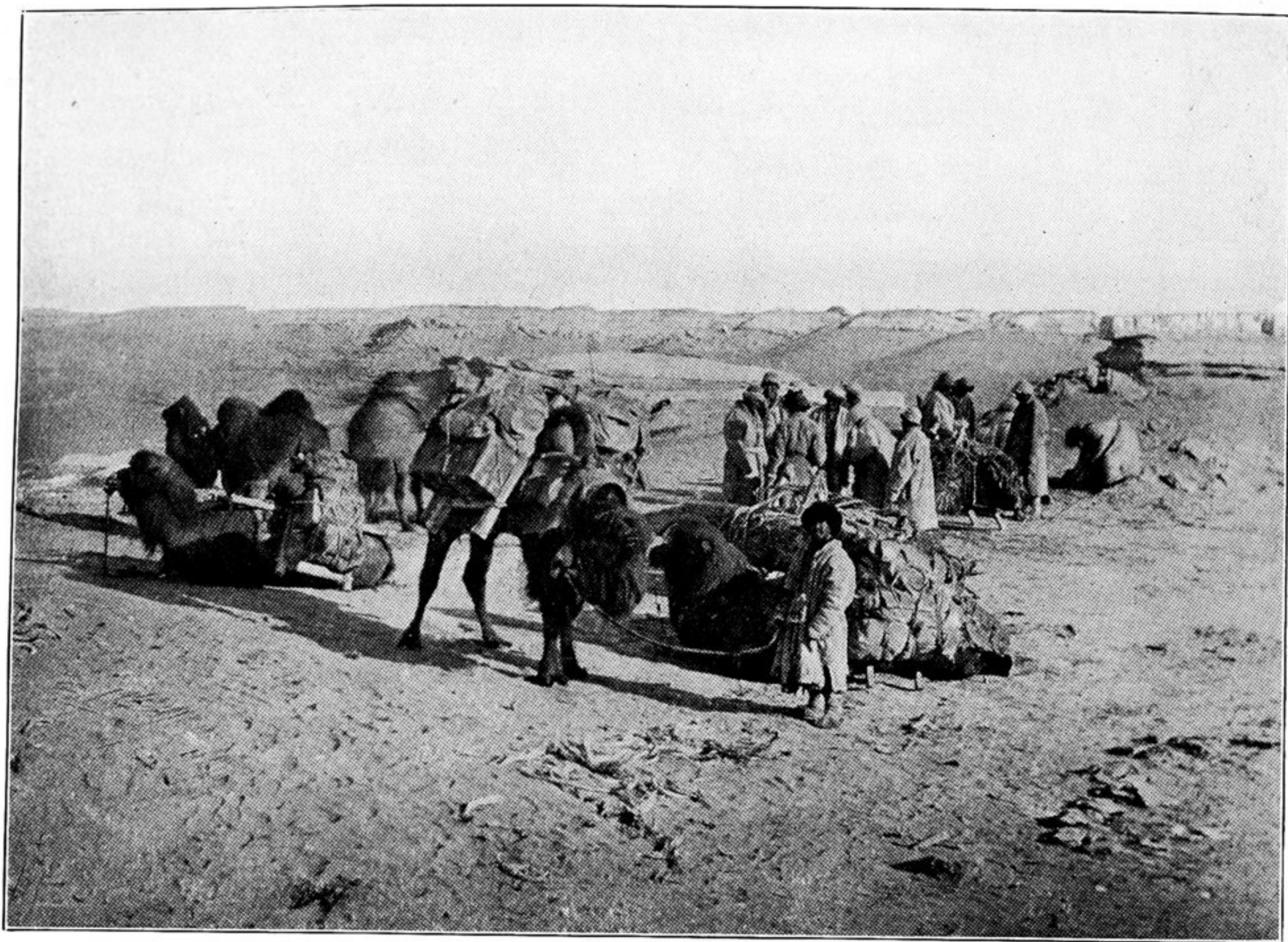
126. CAMELS BEING LOADED FOR START FROM LOP-NOR SITE.