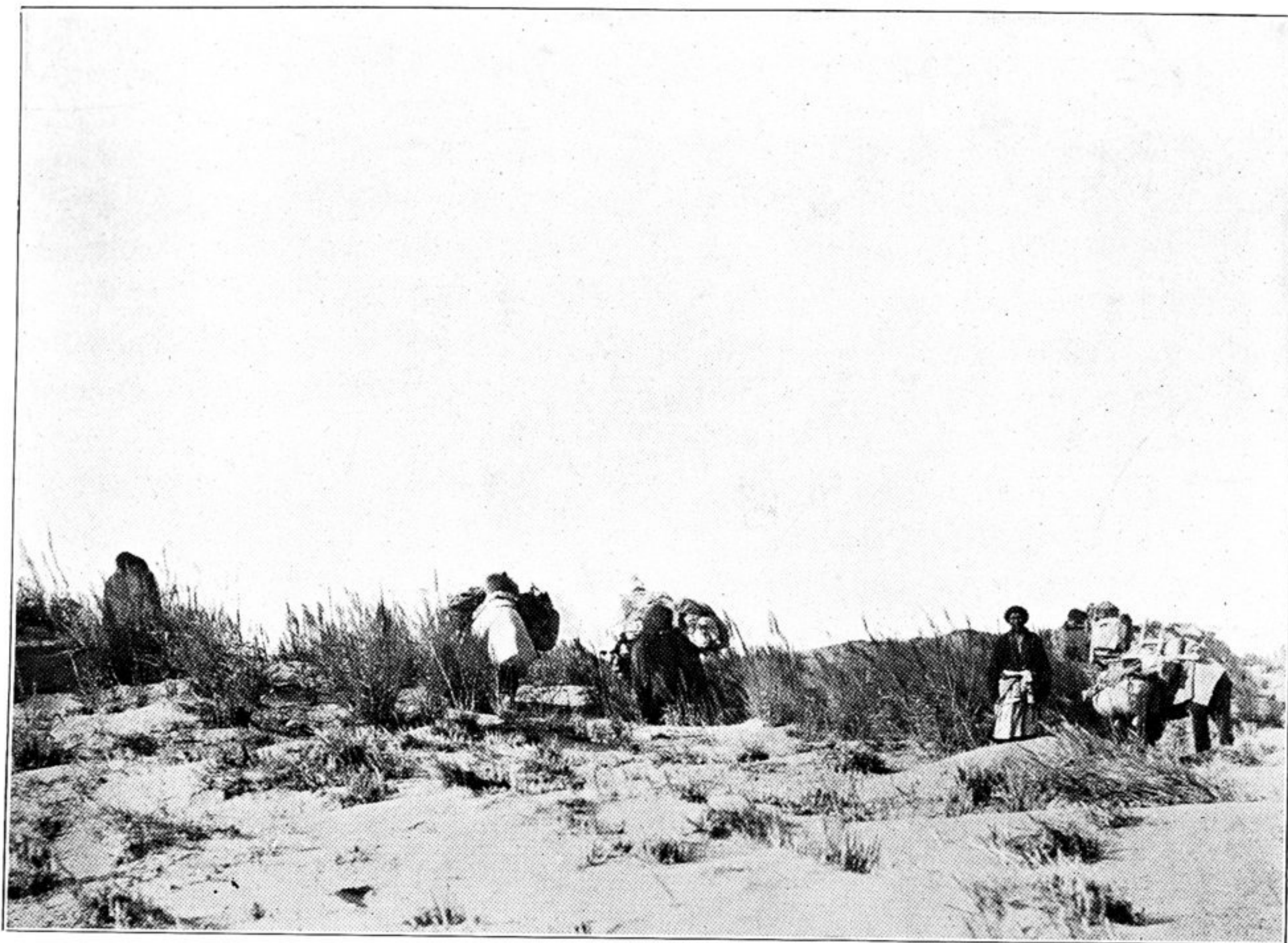
130. CAMELS GRAZING ON FIRST REEDS AFTER CROSSING LOP-NOR DESERT.