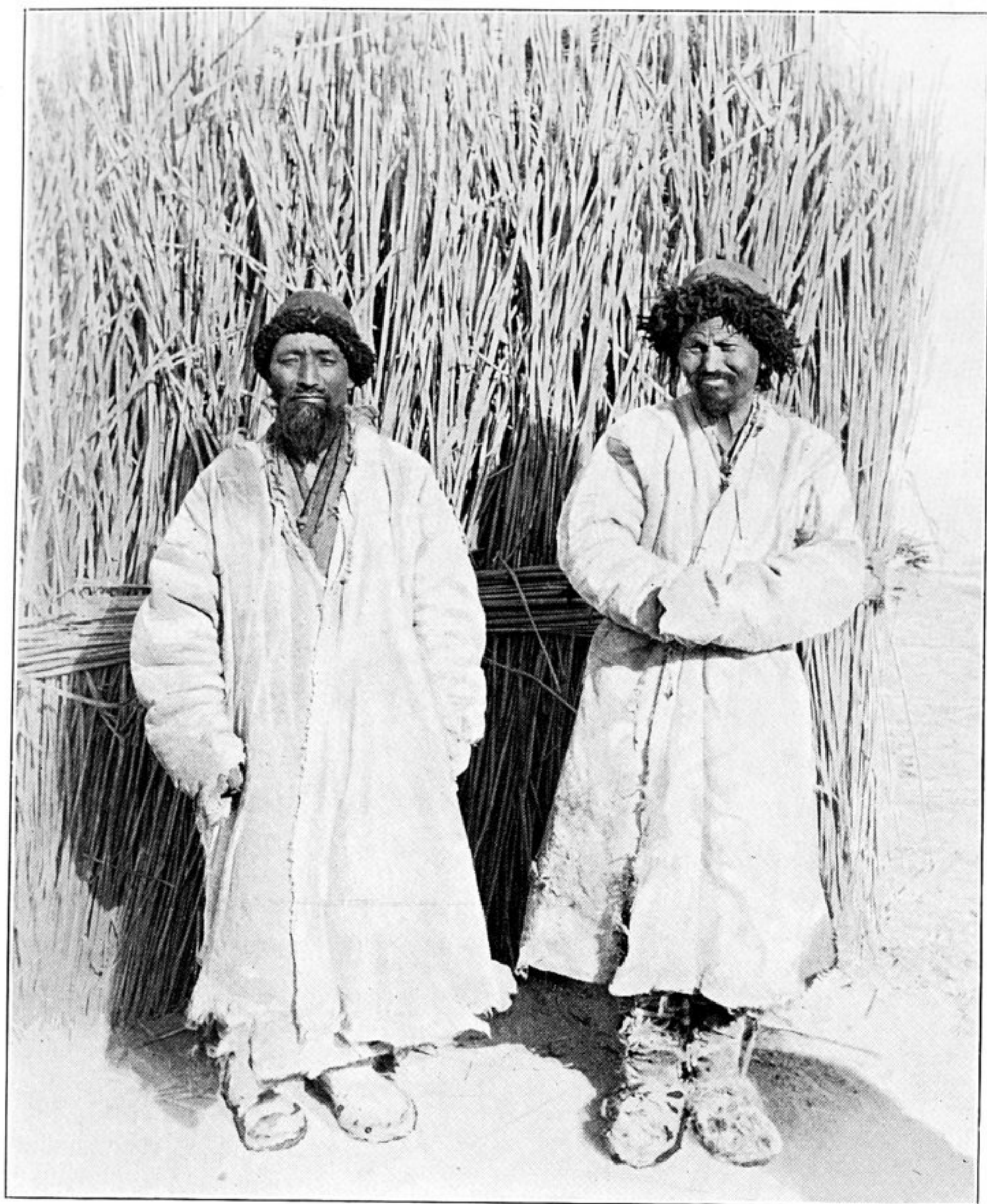
132. HABDAL LABOURERS FROM CHARKLIK.