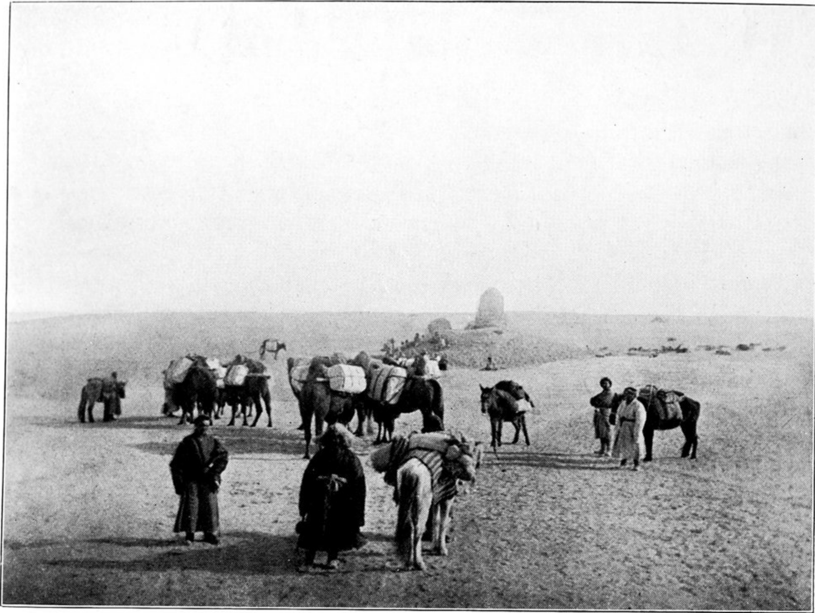
137. TRADING CARAVAN PASSING MIRAN SITE EN ROUTE FOR TUN-HUANG.