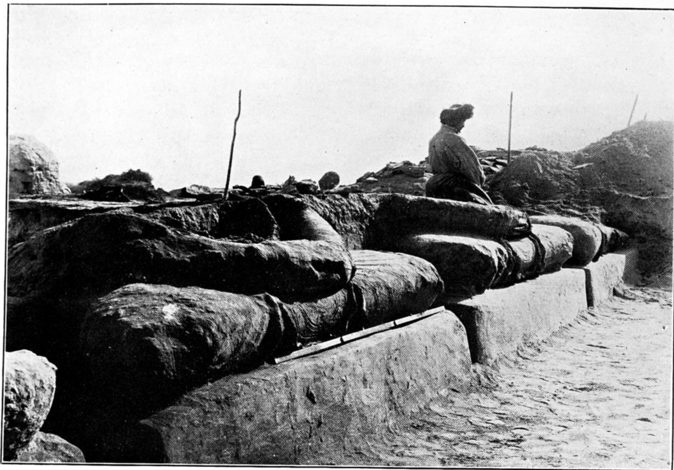
140. REMAINS OF COLOSSAL FIGURES OF SEATED BUDDHAS IN NORTH-EAST PASSAGE OF RUINED SHRINE M. II., MIRAN SITE.