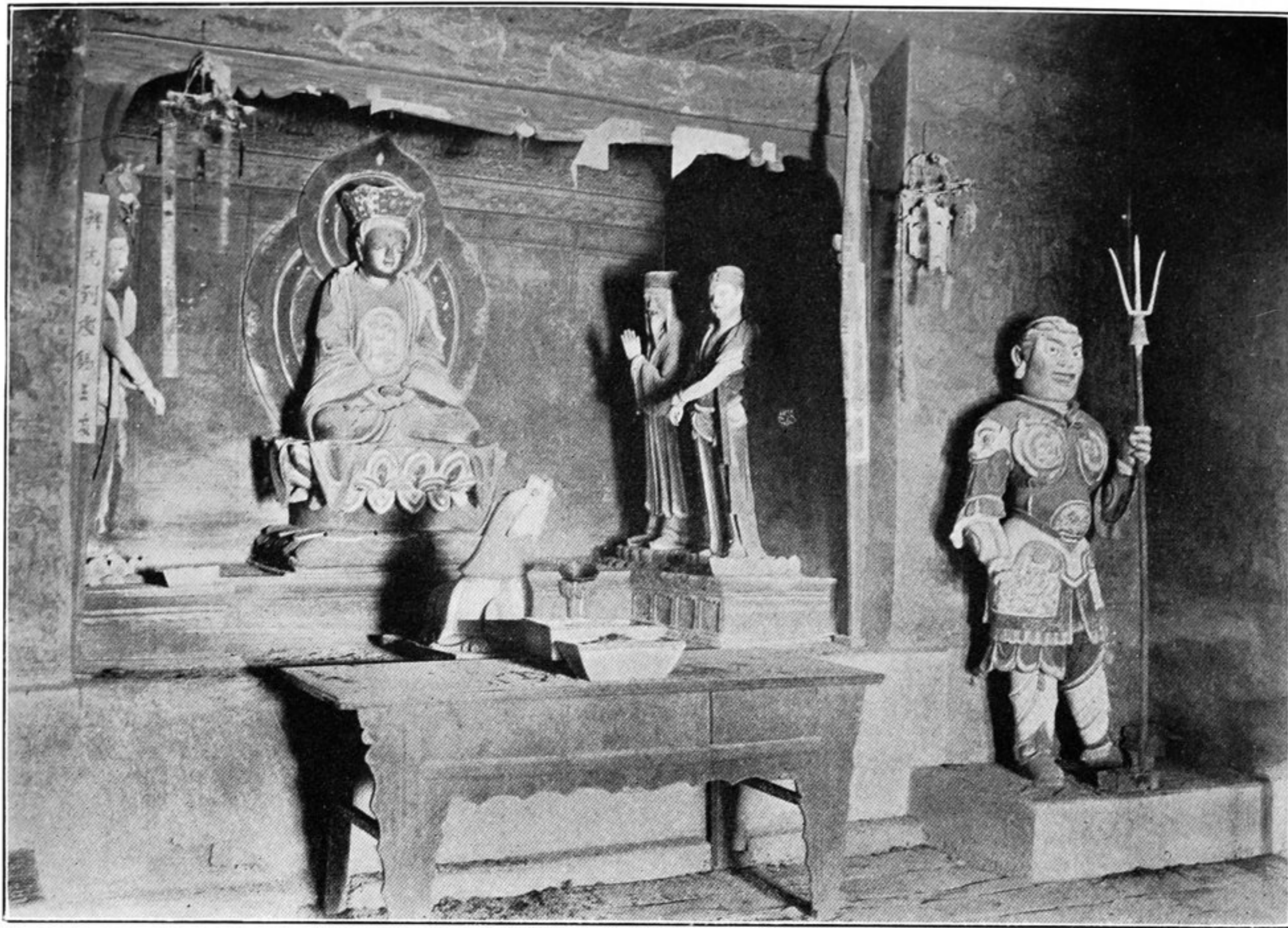
196. MODERN STUCCO IMAGES IN CHINESE STYLE, REPRESENTING HSÜAN-TSANG AS AN ARHAT, WITH ATTENDANTS, IN A CAVE-TEMPLE OF THE 'THOUSAND BUDDHAS,' TUN-HUANG.