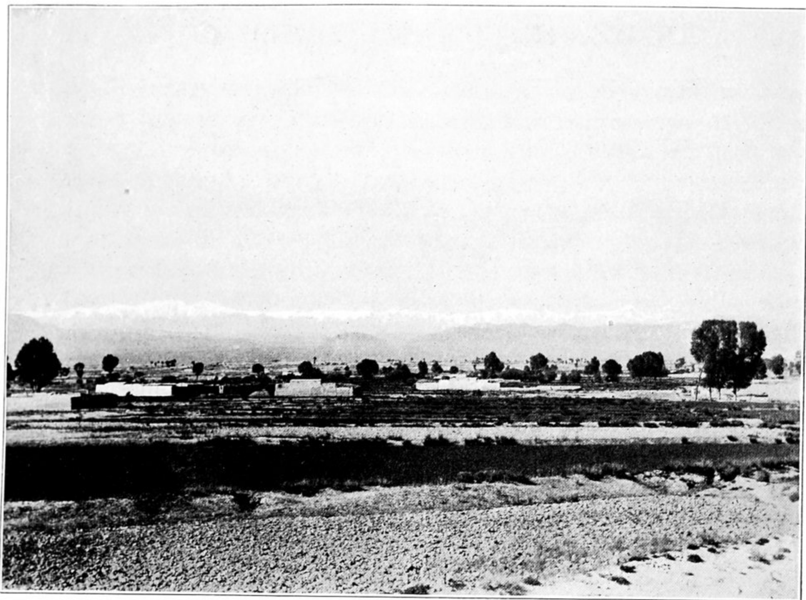
218. VIEW SOUTH-WEST TOWARDS SNOWY MAIN RANGE FROM CH'ANG-MA VILLAGE.